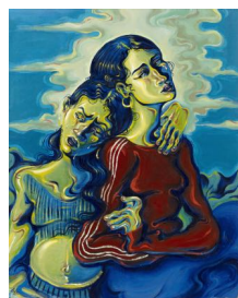
Giorgio Celin Machines For Suffering: The Repetition Compulsion , 2024 Acrylic and oil on canvas 39 3 / 8 x 31 1 / 2 inches (100 x 80 cm) g.celin013705