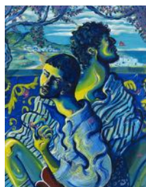
Giorgio Celin Ottobre Ischitano , 2024 Acrylic and oil on canvas 57 1 / 2 x 44 7 / 8 inches (146 x 114 cm) g.celin013704