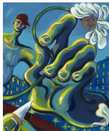
Giorgio Celin I Love Me I Love Me Not , 2024 Acrylic and oil on canvas 21 5 / 8 x 18 1 / 8 inches (55 x 46 cm) g.celin013703