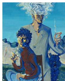
Giorgio Celin Cry Like A Little Girl , 2024 Acrylic and oil on canvas 39 1 / 4 x 31 1 / 2 inches (99.7 x 80 cm) g.celin013706