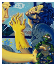
Giorgio Celin Sabado , 2024 Acrylic and oil on canvas 21 5 / 8 x 18 1 / 8 inches (55 x 46 cm) g.celin013707