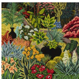
Brittany Fanning Garden With Red Poppies , 2024 Acrylic on canvas 48 x 48 inches (121.9 x 121.9 cm) b.fanning013715