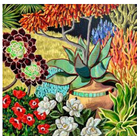
Brittany Fanning Garden With Coral Aloe , 2024 Acrylic on canvas 30 x 30 inches (76.2 x 76.2 cm) b.fanning013720