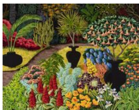
Brittany Fanning Garden With Angel's Trumpet , 2024 Acrylic on canvas 48 x 60 inches (121.9 x 152.4 cm) b.fanning013714