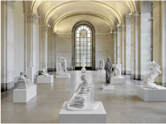
Wim Delvoe. View of the exhibition Carte Blanche à Wim Delvoe: L'Ordre des choses at musées d'Art et d'Histoire, Genève (Switzerland), 2024. ©Wim Delvoe/ADAGP, Paris, 2024. Courtesy of the artist and musées d'Art et d'Histoire de Genève.