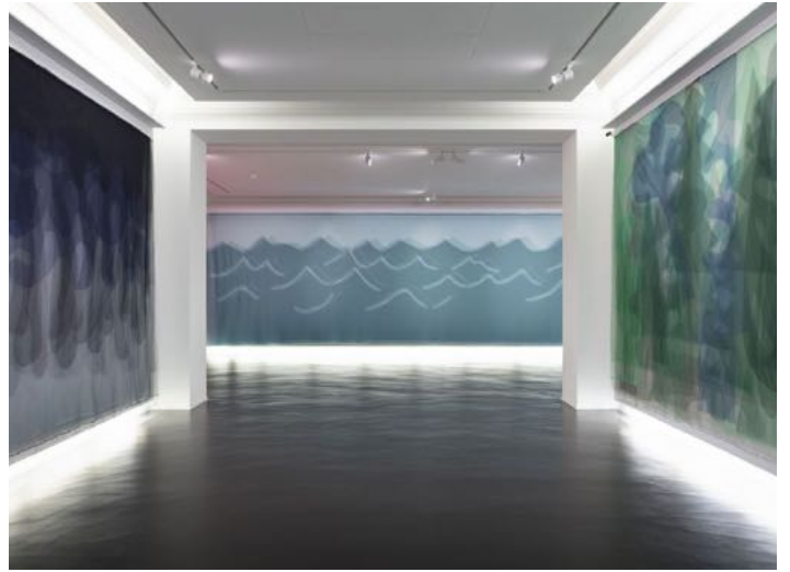
Lionel Estève. View of the exhibition Juste pour voir... at Centre d'Art Contemporain de la Matmut (France), 2024. ©Lionel Estève / ADAGP Paris, 2024. Courtesy of the artist and Centre d'Art Contemporain de la Matmut.

Until June 16 Musée d'Art et d'Histoire, Geneva, Switzerland