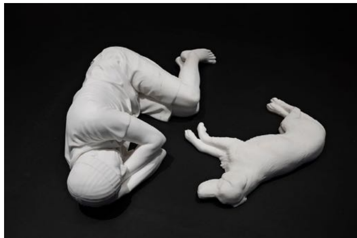
Maurizio Cattelan, Breath , 2023 ©Maurizio Cattelan, 2024.

June 14 — November 24 The National Museum, Oslo, Sweden