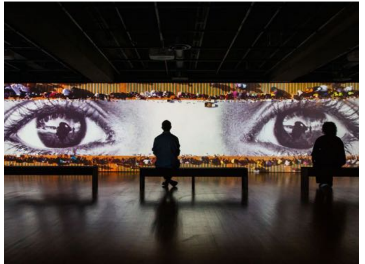
Views of JR's exhibition Déplacé.e.s at the Kulturhuset Stadsteatern, Stockholm, 2024.

This exhibition is presented on the occasion of Normandie Impressionniste Festival