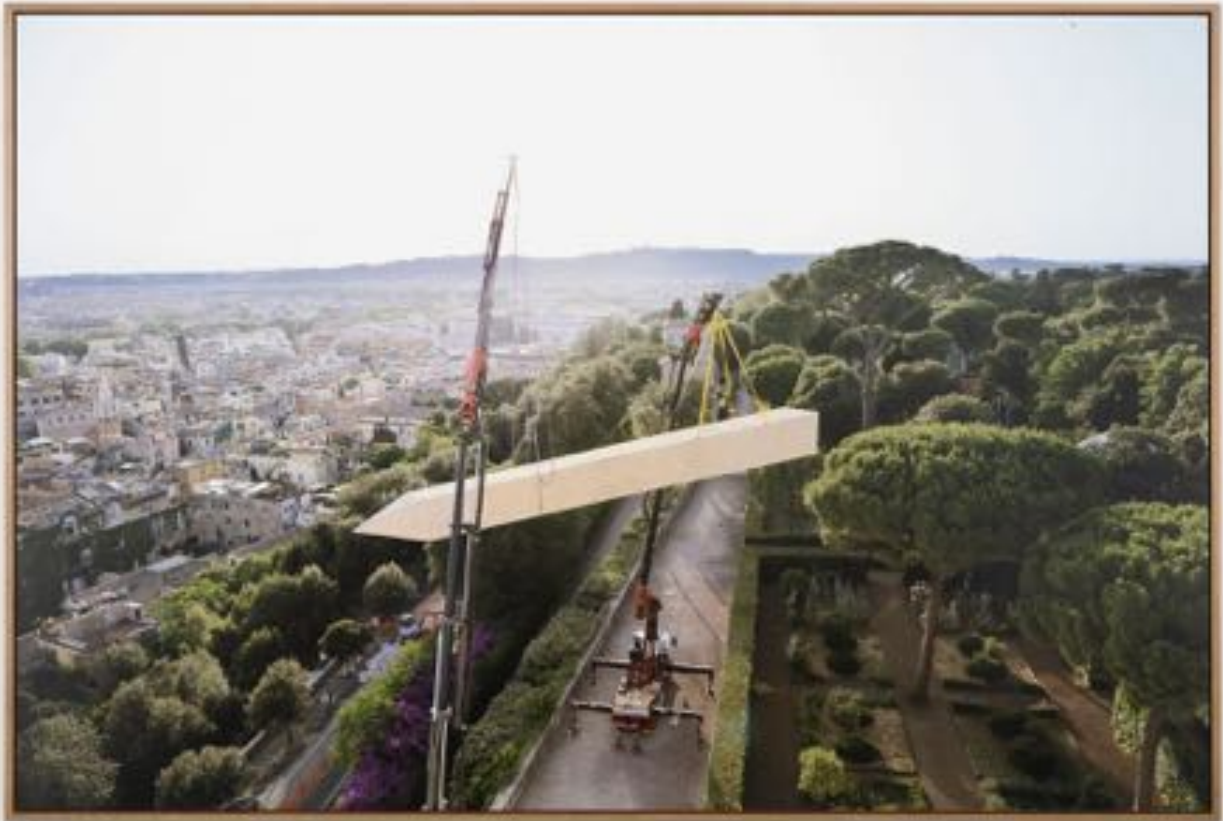
Iván Argote, Levitate , Villa Medici (Rome), 2024. C-print mounted on Dibond. Unframed: 140 x 210 x 3 cm | 55 1/8 x 8 1/4 x 1 3/16 in. ©Iván Argote/ADAGP, Paris, 2024. Courtesy of the artist and Perrotin.