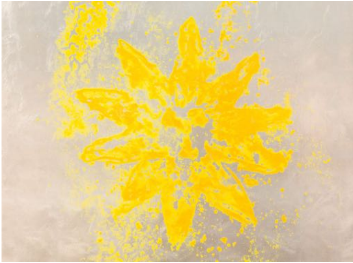
Jean-Michel Othoniel, Passiflora , 2024. Paint on canvas, colored inks on white gold leaf. 164 × 372 × 5 cm | 64 9/16 × 146 7/16 × 1 15/16 in. ©Jean-Michel Othoniel/ADAGP, Paris, 2024.