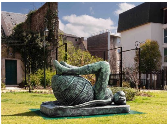
Johan Creten. View of the exhibition Jouer avec le feu at Musée des Beaux-Arts d'Orléans (France), 2024. ©Johan Creten / ADAGP Paris, 2024. Courtesy of Creten Studio, Gerrit Schreurs, Musée des Beaux-Arts d'Orléans and Perrotin.

Until January 12, 2025 Moderna Museet, Stockholm, Sweden