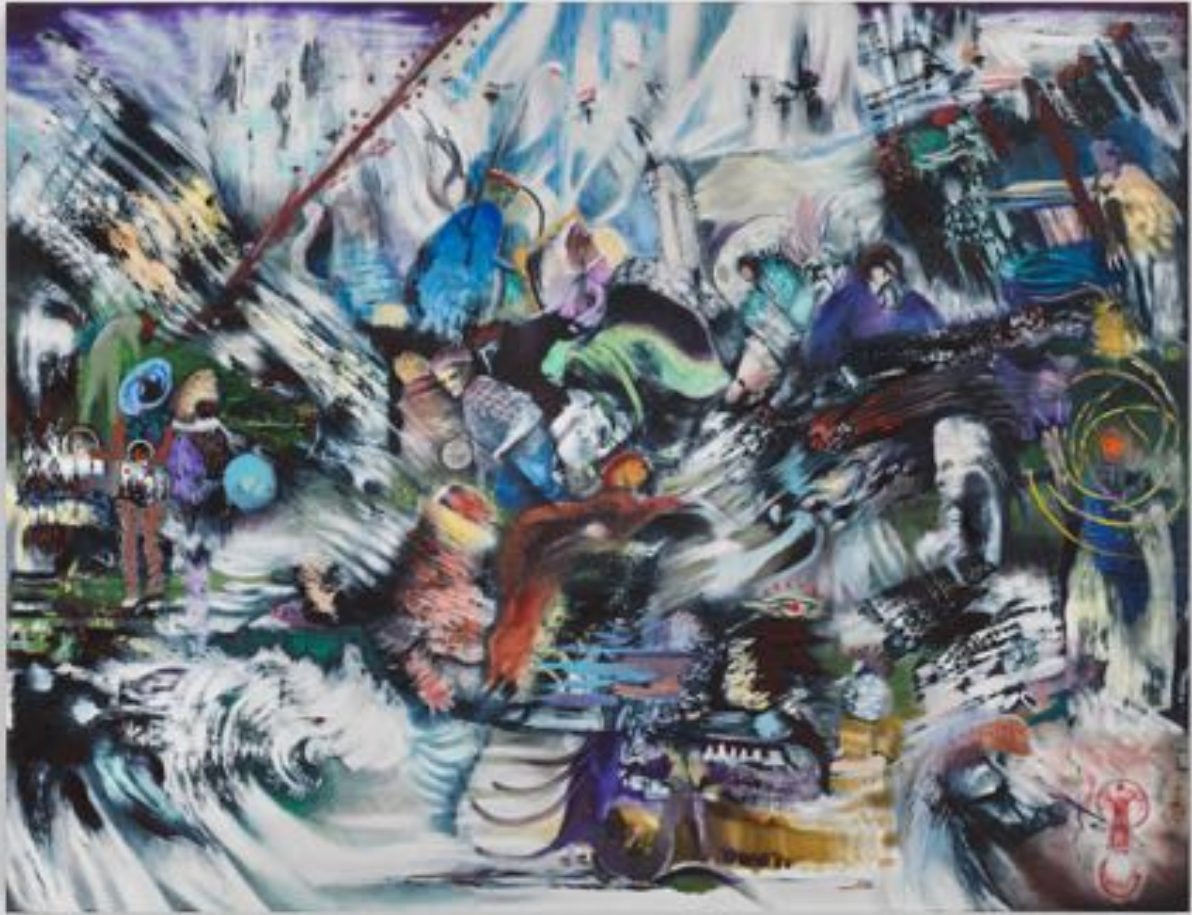
Ali Banisadr, The Mirror World , 2024. Oil on linen. 193 × 248.9 cm | 76 × 98 in.

ranging from the Adventures of Tin Tin to the early-90s graffiti scene of the Bay Area. Having grown up in the tumultuous conditions of war and revolution, his paintings are above all solemn ruminations on current events and the disjunctive conditions—both hopeful and dystopian—that can punctuate modern life.