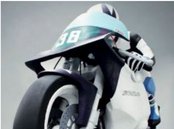
Xavier Veilhan, Sans titre (La Moto) , 1992. © Vaida Budreviciutė ©Veilhan / ADAGP, Paris, 2024. Œuvre de la collection du Frac des Pays de la Loire. Courtesy of the artist and Frac des Pays de la Loire.

June 18 – September 1 Hayward Gallery, London, United Kingdom