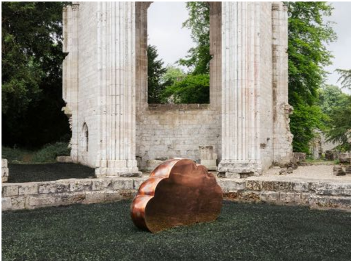
Laurent Grasso, View of the exhibition Clouds Theory at Abbaye de Jumièges Saint-Pierre-de-Varengueville (France), 2024. Photo: Tanguy Beurdeley. ©Laurent Grasso/ADAGP, Paris, 2024. Courtesy of the artist, Abbaye de Jumièges and Perrotin.

Until June 23 Centre d'Art Contemporain de la Matmut, France