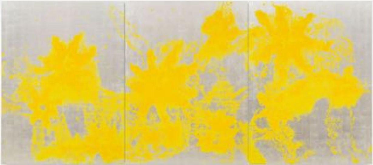
Genesis Belanger, Sleep Walker , 2023. Stoneware, cork, plywood, 111 × 104 × 32cm | 44 × 41 × 13in.