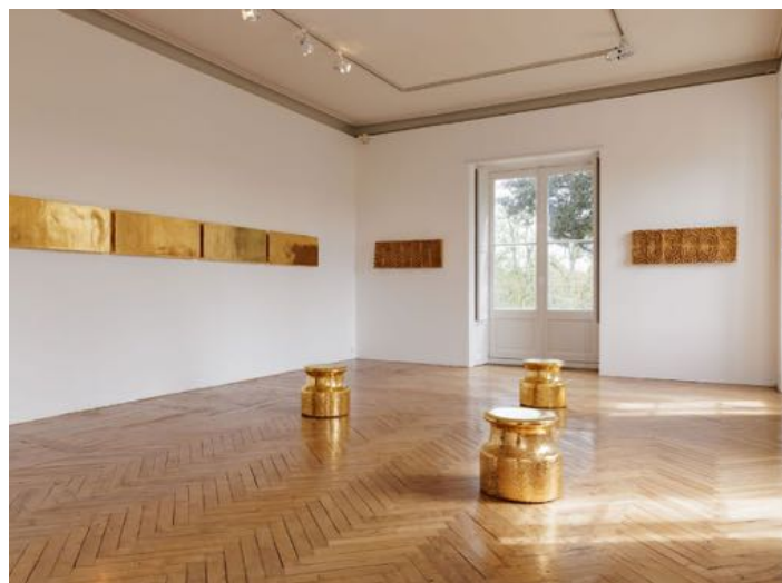
Johan Creten. View of the exhibition Les Fabriques ou la Rage des Utopies at Musée de la Garenne Lemot Gétigné (France), 2024. ©Johan Creten / ADAGP Paris, 2024.

Until September 22 Musée des Beaux-Arts d'Orléans, France