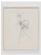
Student (Daumier) , 2024 pencil on paper 30.5 x 21.6 cm 12 x 8 1/2 in