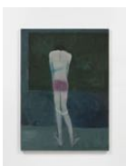
Drawing , 2024 oil on linen 139.7 x 100.3 cm 55 x 39 1/2 in