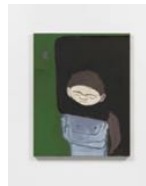
Narrowing , 2024 oil on linen 90.2 x 69.8 cm 35 1/2 x 27 1/2 in