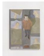
Quiet hour , 2024 oil on canvas 219.7 x 167.6 cm 86 1/2 x 66 in