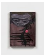
Diffusion , 2024 oil on linen 40.6 x 30.5 cm 16 x 12 in