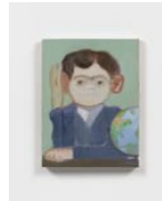
The Answer , 2024 oil on linen 40.6 x 30.5 cm 16 x 12 in