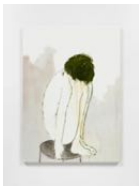
A lesson in weakness , 2024 oil on linen 139.7 x 100.3 cm 55 x 39 1/2 in