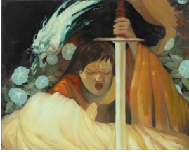
Augustina Wang Thrust, Witness , 2024 Oil on linen 24 x 30 inches (61 x 76.2 cm) a.wang013576