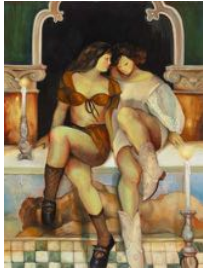
Augustina Wang To Sit On The Seat Of Men , 2024 Oil on canvas 48 x 36 inches (121.9 x 91.4 cm) a.wang013574