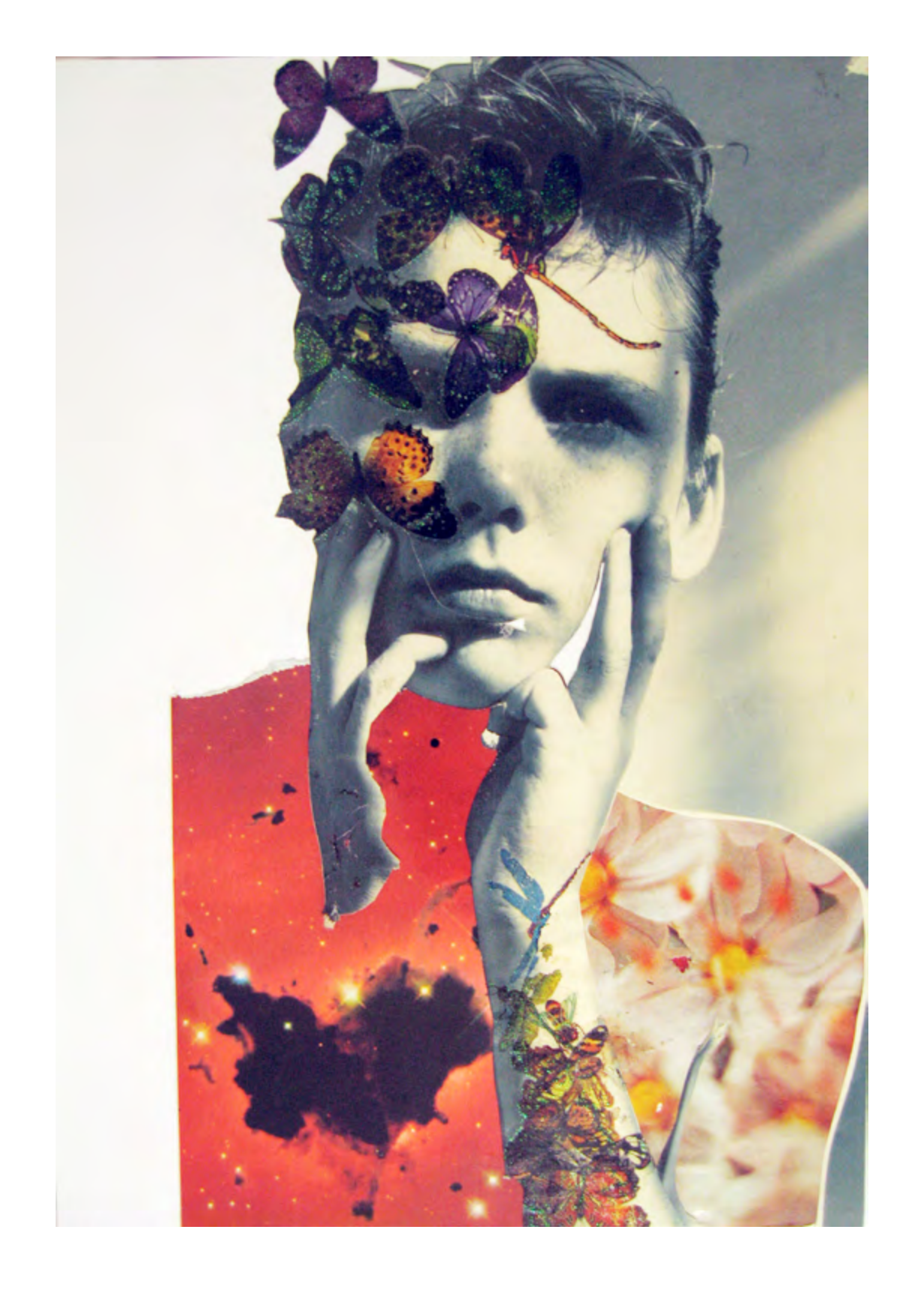
Alex Rose Untitled, 2006 Collage, paper 30.5 x 17.8 cm 12 x 7 in (ARos006)