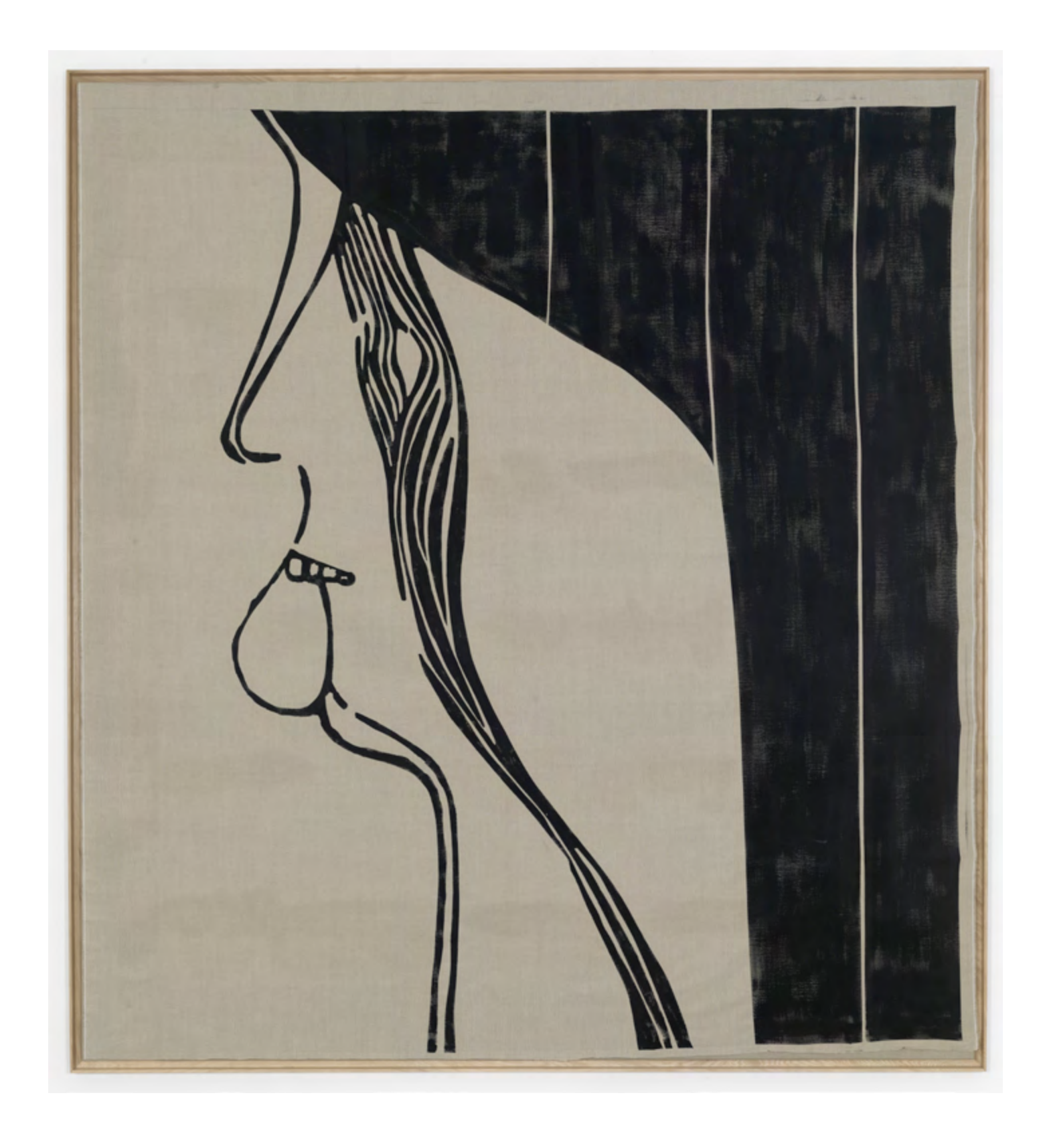
Enrico David Untitled, 2010 Acrylic on linen 340 x 309 cm 133 7/8 x 121 5/8 in (EDav001)