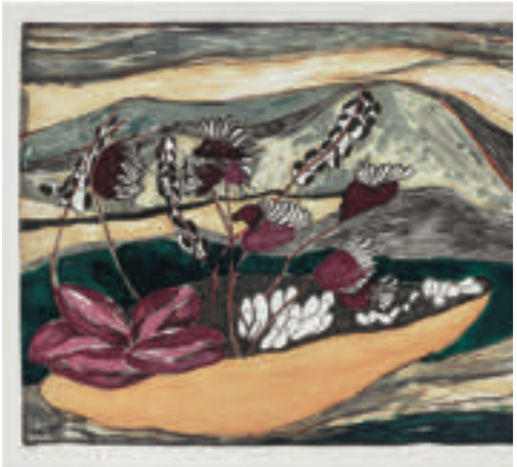
Carnivorous Egg Boat Pizza, 2023 Litograph. 59,5x75,5cm