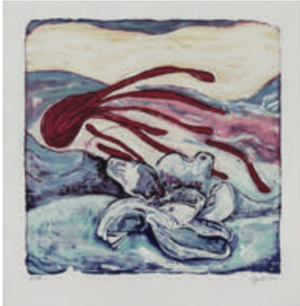
Polvo , 2023. Litograph. 40x39cm