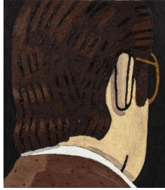
Hannah Wilson Head (Jerry) I , 2024 Oil on canvas 15 3 / 4 x 13 3 / 4 inches (40 x 35 cm) h.wilson013565