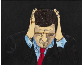
Hannah Wilson Jerry , 2024 Oil on canvas 63 x 78 3 / 4 inches (160 x 200 cm) h.wilson013568