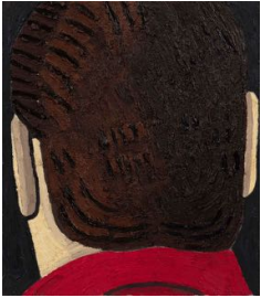
Hannah Wilson Head (Jerry) II , 2024 Oil on canvas 15 3 / 4 x 13 3 / 4 inches (40 x 35 cm) h.wilson013566