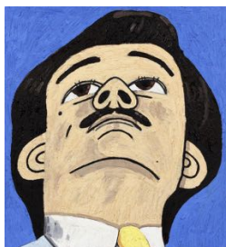
Hannah Wilson Number One Fan , 2024 Oil on canvas 23 5 / 8 x 21 5 / 8 inches (60 x 55 cm) h.wilson013646