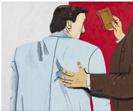
Hannah Wilson The Tape (Rupert) , 2024 Oil on canvas 59 x 70 7 / 8 inches (150 x 180 cm) h.wilson013570