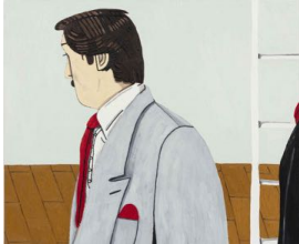
Hannah Wilson The Guest (Rupert) , 2024 Oil on canvas 59 x 70 7 / 8 inches (150 x 180 cm) h.wilson013569