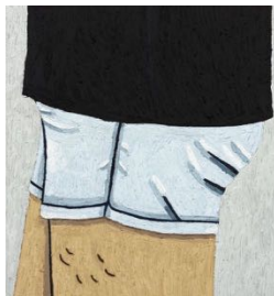
Hannah Wilson Golf Shorts (Jerry) , 2024 Oil on canvas 23 5 / 8 x 21 5 / 8 inches (60 x 55 cm) h.wilson013647