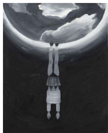
Brittany Tucker Attachment , 2024 Oil on canvas 19 5 / 8 x 15 3 / 4 inches (50 x 40 cm) b.tucker013578