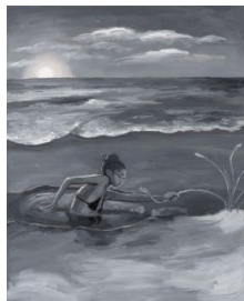
Brittany Tucker A Sinking Feeling , 2024 Oil on canvas 19 5 / 8 x 15 3 / 4 inches (50 x 40 cm) b.tucker013577