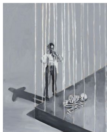
Brittany Tucker Tenses , 2023 Oil on Canvas 19 5 / 8 x 15 3 / 4 inches (50 x 40 cm) b.tucker013580