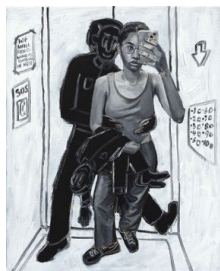
Brittany Tucker It's Going Down , 2023 Oil on canvas 19 5 / 8 x 15 3 / 4 inches (50 x 40 cm) b.tucker013579