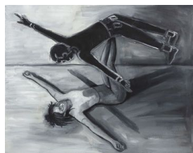
Brittany Tucker Airliners , 2023 Oil on canvas 15 3 / 4 x 19 5 / 8 inches (40 x 50 cm) b.tucker013581