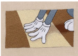
Peter Frederiksen Feeling Like A Win, But It's Yet To Be Determined , 2022 Freehand machine embroidery on linen 5 x 7 inches (12.7 x 17.8 cm) p.frederiksen013587