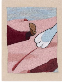
Peter Frederiksen Not Yet Sure Of The Lengths To Which I Would Go , 2021 Freehand machine embroidery on linen 8 x 6 inches (20.3 x 15.2 cm) p.frederiksen013586