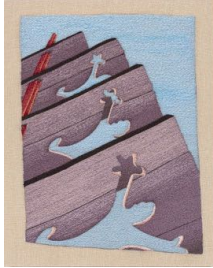
Peter Frederiksen Falling Victim To Old Patterns , 2024 Freehand machine embroidery on linen 10 x 8 inches (25.4 x 20.3 cm) p.frederiksen013642