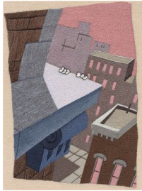
Peter Frederiksen Going To All The Wrong Places , 2024 Freehand machine embroidery on linen 12 x 9 inches (30.5 x 22.9 cm) p.frederiksen013591