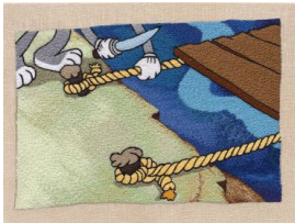
Peter Frederiksen Not Taking Any Chances , 2022 Freehand machine embroidery on linen 6 x 8 inches (15.2 x 20.3 cm) p.frederiksen013585