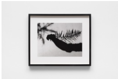
Collier Schorr Selbst portrait (Farn) , 2009 silver gelatin print 61.9 x 74.5 cm 24.4 x 29.3 in