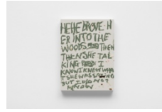
Pope.L Then She Was Talking , 2020-21 oil stick, hair, PVA, epoxy and ink on panel 40.6 x 30.5 cm 16 x 12 in