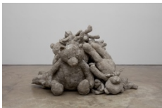
Josh Kline Indifference , 2017 polymerized gypsum, sand, gravel, urethane foam, steel, and acrylic 114 x 202 x 195 cm 44 7/8 x 79 1/2 x 76 3/4 in