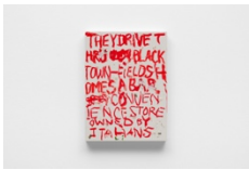
Pope.L Fields Homes Bar , 2020-21 oil stick, hair, PVA, epoxy and ink on panel 40.6 x 30.5 cm 16 x 12 in