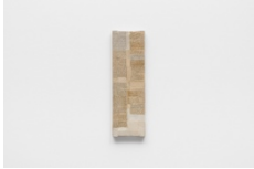
Sarah Rapson Total (New York Times sutra #17) , 2018/2024 Newspaper on linen 39.7 x 12.2 cm 15 5/8 x 4 3/4 in