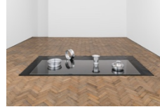
Phillip Lai Certain pressures , 2014 aluminium, rubber, acrylic 30 x 289 x 139.5 cm 11 3/4 x 113 3/4 x 54 7/8 in