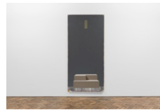
Michael Simpson Squint 77 , 2022 oil on canvas 230 x 108 cm 90 1/2 x 42 1/2 in