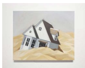
Cate Pasquarelli Linda's House , 2023 Oil on canvas 16 x 20 inches (40.6 x 50.8 cm) c.pasquarelli013543