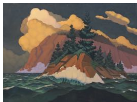
Nathaniel Meyer Daybreaker (Headlands II) , 2023 Oil on canvas 36 x 48 inches (91.4 x 121.9 cm) n.meyer013564