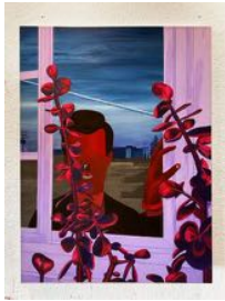
Chris Fallon Moth Season , 2023 Acrylic on canvas 40 x 30 inches (101.6 x 76.2 cm) c.fallon013541