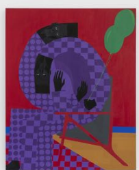
Jon Key Three Two , 2023 Acrylic and oil on panel 60 x 48 inches (152.4 x 121.9 cm) j.key012866