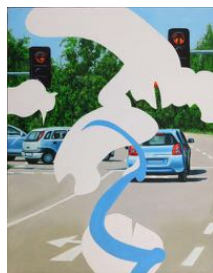
Margaux Valengin Crassula , 2024 Oil on canvas 18 x 14 inches (45.7 x 35.6 cm) m.valengin013539