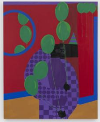
Jon Key Balloons Entangle Me , 2023 Acrylic and oil on panel 60 x 48 inches (152.4 x 121.9 cm) j.key012864