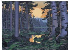
Nathaniel Meyer Tidal Forest , 2023 Oil on canvas 36 x 48 inches (91.4 x 121.9 cm) n.meyer013563