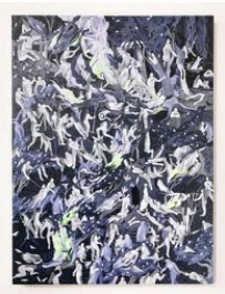
Kay Seohyung Lee Cuckooland , 2020 Acrylic on canvas 48 x 36 inches (121.9 x 91.4 cm) k.lee013558