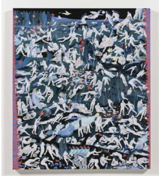
Kay Seohyung Lee Nightfight , 2021 Acrylic on canvas 60 x 50 inches (152.4 x 127 cm) k.lee013571