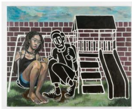
Brittany Tucker Adulting , 2023 Acrylic on canvas 47 1 / 4 x 59 inches (120 x 150 cm) b.tucker013234