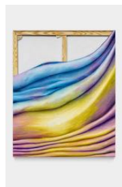
Jeremy Shockley Over the Shoulder , 2023 Oil on canvas 57 x 49 inches (144.8 x 124.5 cm) j.shockley013545