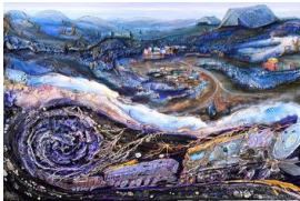
Kate Klingbeil Polar Vortex/Midnight Express , 2023 Acrylic, pigment, ceramic, asphalt, glass, wood, vinyl paint, pumice, sand, garnet, mirror, rocks and micro plastics from Lake Michigan, found objects, and oil stick on canvas 66 1/2 x 102 x 3 inches (168.9 x 259.1 x 7.6 cm) k.klingbeil012870