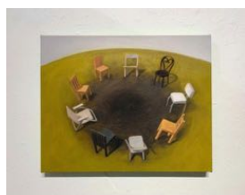
Cate Pasquarelli Circle , 2024 Oil on canvas 16 x 20 inches (40.6 x 50.8 cm) c.pasquarelli013544