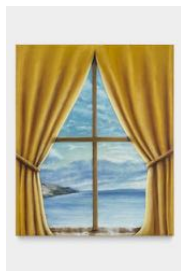
Jeremy Shockley Madeira , 2023 Oil on linen 48 x 40 inches (121.9 x 101.6 cm) j.shockley013546