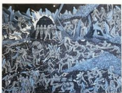
Kay Seohyung Lee Dark , 2022 Gouache on birch panel 30 x 40 inches (76.2 x 101.6 cm) k.lee013547