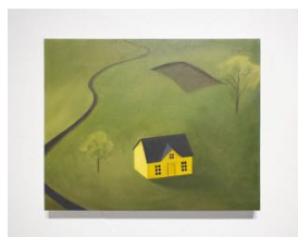
Cate Pasquarelli Small Town No. 3 , 2023 Oil on canvas 16 x 20 inches (40.6 x 50.8 cm) c.pasquarelli013573