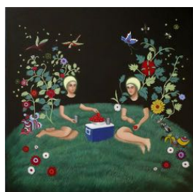
Jessica Wee Déjeuner sur l'herbe , 2023 Oil on linen 30 x 30 inches (76.2 x 76.2 cm) j.wee013052