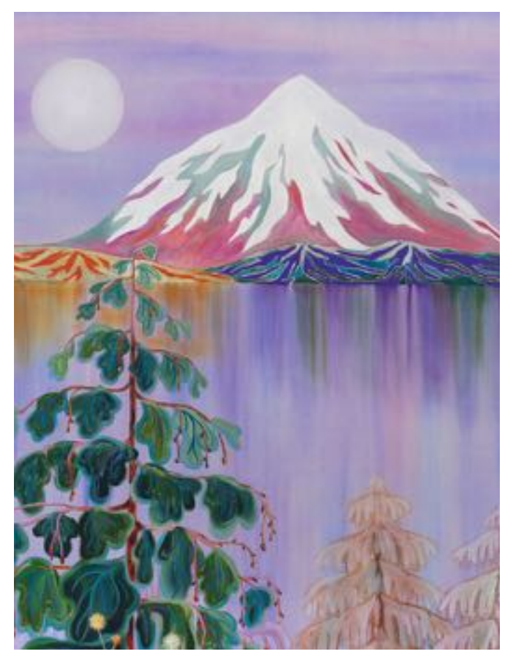
Freya Douglas-Morris, Craspedia, 2024 (detail)

In Craspedia Douglas-Morris depicts a mountain seen from a distance across a still lake. Filled with cool pink and purple hues, the serene water is painted with a sheer wash of color that reflects the smaller mountains along the shoreline. Here, the artist uses a thin layer of oil paint to approximate the effect of watercolor, echoing the water-based technique to render imagery of water with remarkable technical skill. As in other work, Craspedia is not a scene from a specific place instead, Douglas-Morris explores the image of a mountain as an intuitive idea. Here and throughout the exhibition, the artist presents her canvases as a window into another realm. Rather than recreating physical landscapes, Douglas-Morris depicts internal terrain, open to her viewer's own journeys, experiences, relationships, and memories. In visualizing such "felt places," the artist's work occupies a certain universal space, reminding us of our own connection to the natural world and the inner worlds we carry within—the ones we take with us wherever we go.