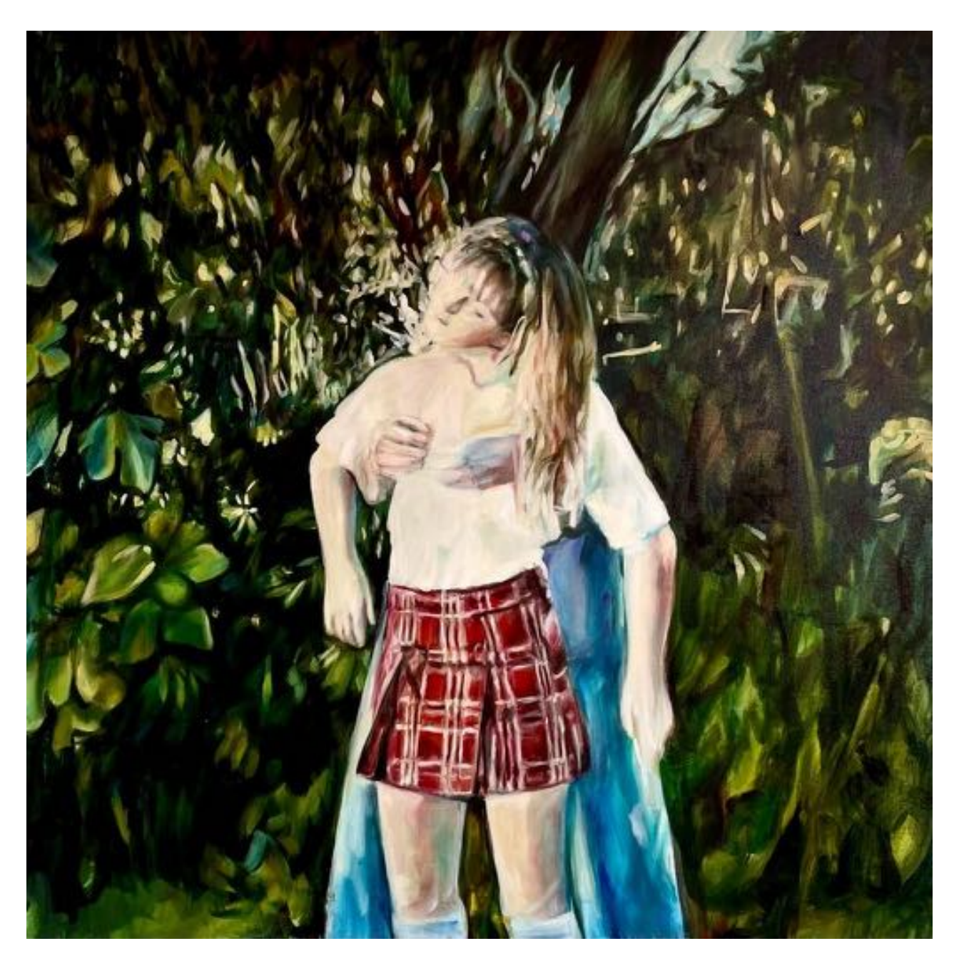
Iva Lulashi, L'offesa e l'ombra, 2023, oil on canvas , 100 x 100 cm.