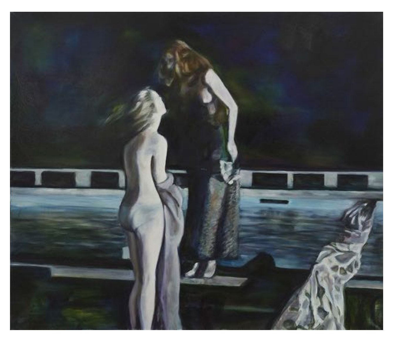
Iva Lulashi, Non inciampare, 2022, oil on canvas, 108 x 125 cm.