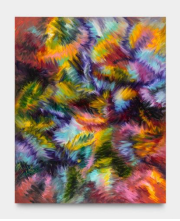
Sasha Ferré, I remember how the earth felt , 2023 - Oil stick and tempera on wood panel - 160 x 130 cm, 63 x 51 in - Courtesy of the Artist and Almine Rech - Photo: Nicolas Brasseur

Almine Rech New York is pleased to announce Averno , Sasha Ferré's second solo exhibition with the gallery, on view from January 19 to March 2, 2024.