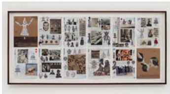
Marcel Dzama The Strategy of a Pure Symbolic Order , 2011 Collage, pencil, ink, and watercolor on paper 12 parts Framed: 26 3/8 x 56 3/4 inches 67 x 144.1 cm Each: 10 3/4 x 8 1/4 inches 27.3 x 21 cm DZAMA3069