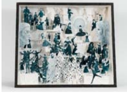
Marcel Dzama Hastily Grabbing Those Innocent Pawns, 2013 Diorama: wood, glass, cardboard, paper collage, watercolor, and ink 21 1/2 x 25 1/8 x 12 inches 54.6 x 63.8 x 30.5 cm DZAMA3454