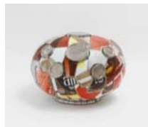
Marcel Dzama The Rook's Head, 2012 Sculpture: Ceramic and tin Drawing: Ink, gouache, and graphite on paper Sculpture Height: 15 1/2 inches, 39.4 cm Diameter: 21 inches, 53.3 cm Drawing 14 x 11 inches 35.6 x 27.9 cm DZAMA3316