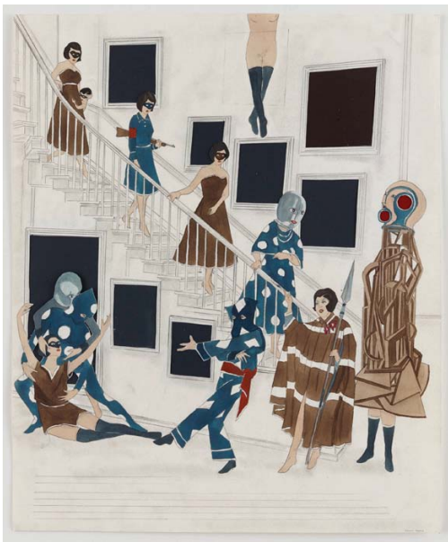
Shall We Venture Outside , 2013. Ink, gouache, and graphite on paper 17 x 14 inches (43.2 x 35.6 cm)

David Zwirner is pleased to present an exhibition of recent and new work by Marcel Dzama, on view at the gallery's 24 Grafton Street space in London. Puppets, Pawns, and Prophets features three videos inspired by the game of chess, as well as puppets and masks based on the characters, drawings, collages, dioramas, and sculptural works.