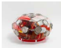
Marcel Dzama The Rook's Head, 2012 Sculpture: Ceramic and tin Drawing: Ink, gouache, and graphite on paper Sculpture Height: 16 inches, 40.6 cm Diameter: 24 inches, 61 cm Drawing 14 x 11 inches 35.6 x 27.9 cm DZAMA3317