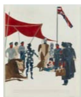
Marcel Dzama The Ned Kelly Armour Defense , 2013 Ink, gouache, graphite, and collage on paper 4 pages Overall: 23 1/8 x 16 1/4 inches 58.7 x 41.3 cm Each: 11 1/2 x 8 1/8 inches 29.2 x 20.6 cm Framed: 28 1/4 x 21 1/4 inches 72 x 54 cm DZAMA3440