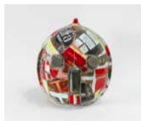
Marcel Dzama The King's Head, 2012 Sculpture: Ceramic and tin Drawing: Ink, gouache, and graphite on paper Sculpture: 21 x 16 1/2 x 19 inches 53.3 x 41.9 x 48.3 cm Drawing: 14 x 11 inches 35.6 x 27.9 cm DZAMA3310