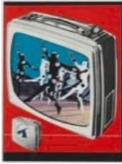
Marcel Dzama The Portable Death Disco Dance , 2013 Collage on paper 12 x 9 inches 30.5 x 22.9 cm Framed: 16 1/4 x 13 3/8 inches 41.3 x 33.8 cm DZAMA3438