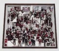
Marcel Dzama Feeding squirrels to the nuts, 2011 Diorama: wood, glass, cardboard, paper collage, watercolor, and ink 21 1/2 x 25 1/4 x 12 inches 54.6 x 64.1 x 30.5 cm DZAMA2999