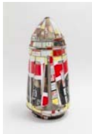
Marcel Dzama The Bishop's Head, 2012 Sculpture: Ceramic and tin Drawing: Ink, gouache, and graphite on paper Sculpture Height: 28 1/2 inches, 72.4 cm Diameter: 16 1/2 inches, 41.9 cm Drawing 14 x 11 inches 35.6 x 27.9 cm DZAMA3312