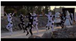
Marcel Dzama Death Disco Dance , 2011 Video on monitors, 4 min, (loop), color, sound accompanied by Wooden Box (Death Disco Dance) Dimensions variable with installation Edition 4 of 4 + 2 APs, EP2 DZAMA3121.4