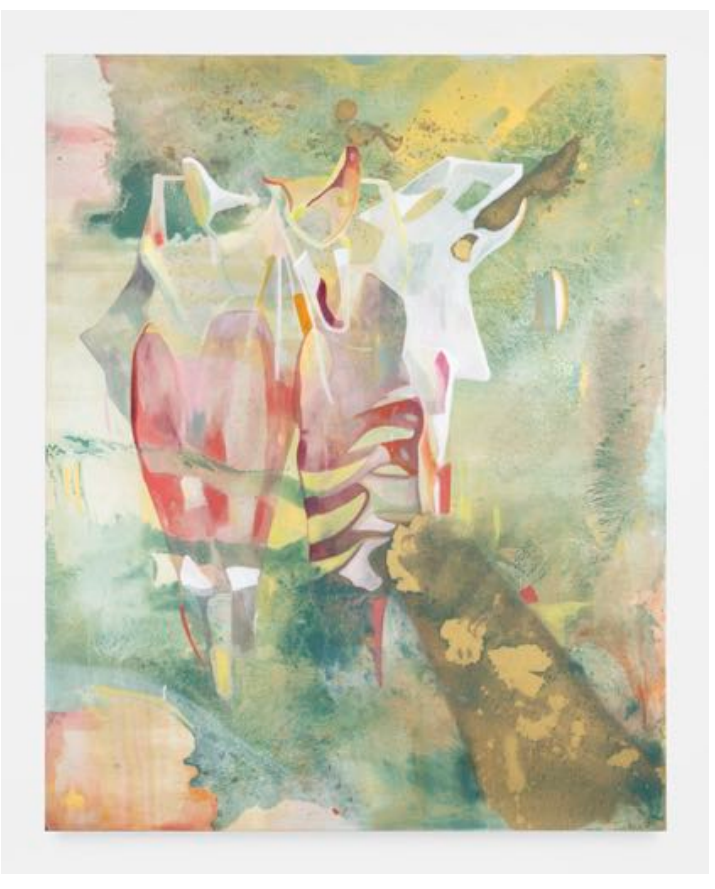
造型 Figure , 2023. 布面丙烯与水彩、金粉与珠光颜料及装饰物 | Acrylic and watercolor on canvas, pearlescent and golden pigments, glitter. 162 x 130 cm.

从此以后,玛蒂尔德·丹尼斯与绘画和解了,她不再用"笔尖"作画, 而是将绘画转变为自主导演的剧场:她不加选择,使用从电影片场里 找到的废弃油漆罐中的颜料,还有从伊斯坦布尔市场上买到的小罐 珠光颜料;她始终保持着对于"置景"(mise-en-scène)艺术的欣赏, 但也喜欢前苏联导演谢尔盖·帕拉杰诺夫神秘主义的自制电影,或美 国画家乔治亚·奥基夫看似天真却蕴含深意的花卉绘画。"我从不问 自己主题是什么,"玛蒂尔德·丹尼斯说,"我垂直地创造对比,然后 等待惊喜降临。"