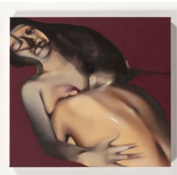
Elsa Rouy Chaos Spill , 2023 Ink, acrylic and charcoal on canvas 21 1 / 4 x 23 5 / 8 inches (54 x 60.1 cm) e.rouy013436