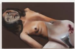
Elsa Rouy The Only Daughter , 2023 Ink, oil, acrylic and charcoal on canvas 27 1 / 2 x 43 1 / 4 inches (70 x 110 cm) e.rouy013433