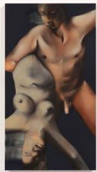
Elsa Rouy Masculin, Feminin , 2023 Ink, acrylic and charcoal on canvas 47 1 / 4 x 25 1 / 2 inches (120 x 64.8 cm) e.rouy013439