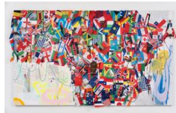
DEWEY CRUMPLER East, West, North & South , 2021

Acrylic and metal leaf on canvas 60 x 72 inches (152.4 x 182.9 cm.) (DEC23-142)