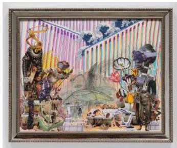
DEWEY CRUMPLER Digit, Digit, Digit , 2018

Mixed media collage 18 1/2 x 22 1/2 inches (47 x 57.1 cm.) (DEC23-022)