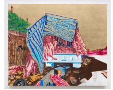
DEWEY CRUMPLER Untitled, Truck , 2016

Acrylic on canvas 60 x 72 inches (152.4 x 152.9 cm.) (DEC23-140)