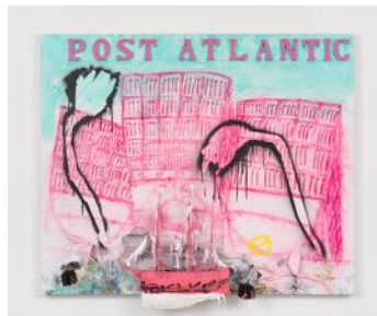
DEWEY CRUMPLER P. Atlantic , 2021

Acrylic and mixed media on canvas 60 x 72 inches (152.4 x 182.9 cm.) (DEC23-154)