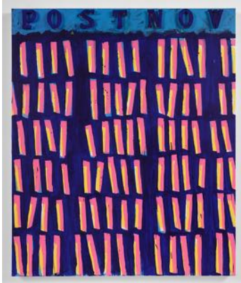
DEWEY CRUMPLER Post Now , 2018

Acrylic on canvas 72 x 60 x 3 inches (182.9 x 152.4 x 7.6 cm.) (DEC23-101)