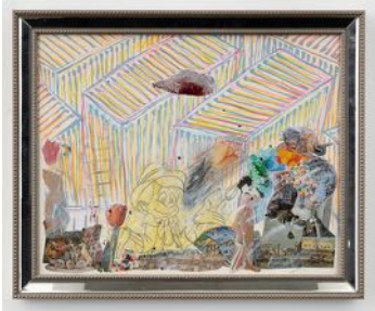
DEWEY CRUMPLER The Watery New , 2018

Mixed media collage 18 1/2 x 22 1/2 inches (47 x 57.1 cm.) (DEC23-021)