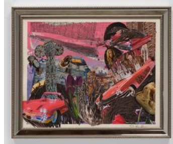
DEWEY CRUMPLER Pink on Pink , 2018

Mixed media collage 18 1/2 x 22 1/2 inches (47 x 57.1 cm.) (DEC23-017)