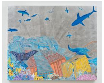
DEWEY CRUMPLER The Deep , 2018

Acrylic and mixed media on canvas 60 x 72 inches (152.4 x 182.9 cm.) (DEC23-154)