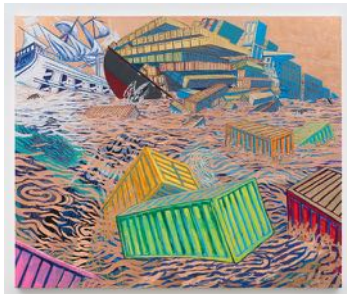
DEWEY CRUMPLER Breach , 2023

Acrylic and metal leaf on canvas 60 x 72 inches (152.4 x 182.9 cm.) (DEC23-141)