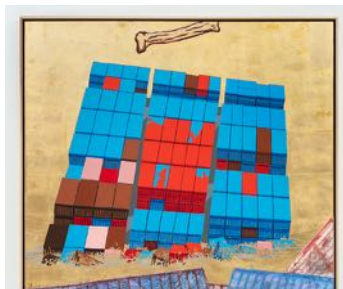
DEWEY CRUMPLER BONE , 2016

Mixed media collage 18 1/2 x 22 1/2 inches (47 x 57.1 cm.) (DEC23-018)