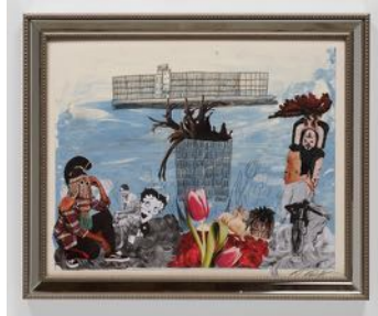
DEWEY CRUMPLER We Don't Die, We Multiply , 2018

Mixed media collage 18 1/2 x 22 1/2 inches (47 x 57.1 cm.) (DEC23-021)