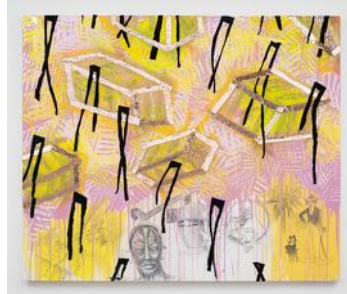
DEWEY CRUMPLER Time Mist , 2019

Acrylic and mixed media on canvas 60 x 72 inches (152.4 x 182.9 cm.) (DEC23-143)