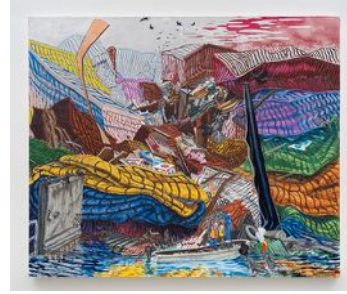
DEWEY CRUMPLER Crows , 2023

Acrylic and mixed media on canvas 60 x 72 inches (152.4 x 182.9 cm.) (DEC23-143)