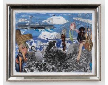
DEWEY CRUMPLER Moe , 2018

Mixed media collage 18 1/2 x 22 1/2 inches (47 x 57.1 cm.) (DEC23-020)