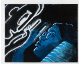
Brittany Tucker Phone Sex , 2023 Acrylic on canvas 11 x 13 3 / 4 inches (28 x 35 cm) b.tucker013229