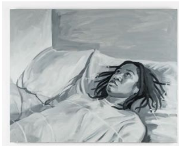
Brittany Tucker A Voyage to Lilliput , 2023 Acrylic on canvas 31 1 / 2 x 39 3 / 8 inches (80 x 100 cm) b.tucker013227