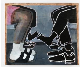
Brittany Tucker Double Date , 2023 Acrylic on canvas 19 5 / 8 x 23 5 / 8 inches (50 x 60 cm) b.tucker013233