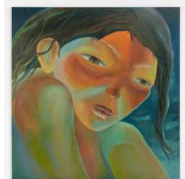
Yuma Radne Nostalgia , 2023 Oil on canvas 63 x 61 inches (160 x 155 cm) y.radne013270