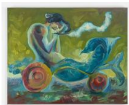
Yuma Radne Der Weg alleine , 2023 Oil on canvas 39 3 / 8 x 49 1 / 4 inches (100 x 125 cm) y.radne013271