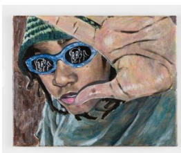
Brittany Tucker Boundaries , 2023 Acrylic on canvas 11 x 9 7 / 8 inches (28 x 25 cm) b.tucker013230