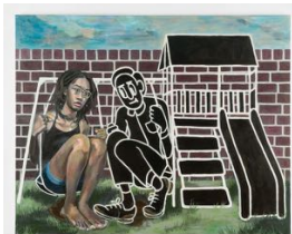
Brittany Tucker Adulting , 2023 Acrylic on canvas 47 1 / 4 x 59 inches (120 x 150 cm) b.tucker013234