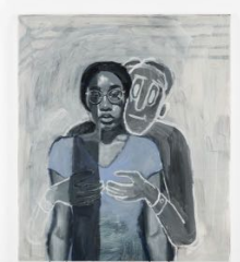
Brittany Tucker Out The Window , 2023 Acrylic on canvas 23 5 / 8 x 19 5 / 8 inches (60 x 50 cm) b.tucker013232