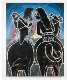
Brittany Tucker Wild Horses , 2023 Acrylic on canvas 39 3 / 8 x 31 1 / 2 inches (100 x 80 cm) b.tucker013228