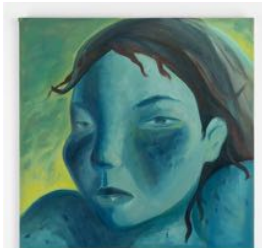
Yuma Radne Sie fragt wieso , 2023 Oil on canvas 24 3 / 4 x 24 3 / 8 inches (63 x 62 cm) y.radne013269