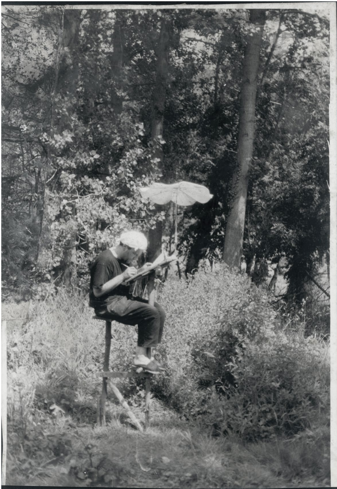
ÉCRITOIRE (Summer) , 1991 ink on photograph 29.8 × 20.6 cm, 11 5 / 8 × 8 in.