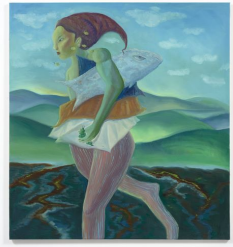
Yuma Radne Keep on walking , 2023 Oil on canvas 59 x 55 1 / 8 inches (150 x 140 cm) y.radne012970