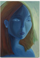
Yuma Radne Feeling blue , 2023 Oil on canvas 45 1 / 4 x 31 1 / 2 inches (115 x 80 cm) y.radne013118