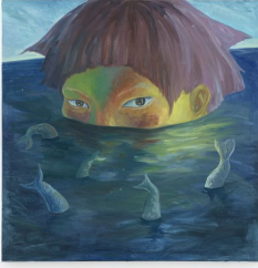
Yuma Radne In the water , 2023 Oil on canvas 39 3 / 8 x 39 3 / 8 inches (100 x 100 cm) y.radne012971