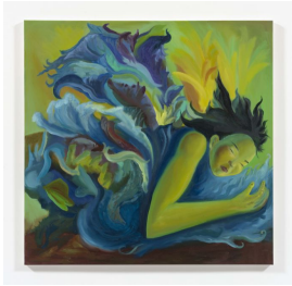
Yuma Radne Covered with petals, sea and sky , 2023 Oil on canvas 43 1 / 4 x 43 1 / 4 inches (110 x 110 cm) y.radne013117