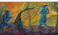
Yuma Radne Dance, dance to my song hypnotique , 2023 Oil on canvas 68 7 / 8 x 126 inches (175 x 320 cm) y.radne013123