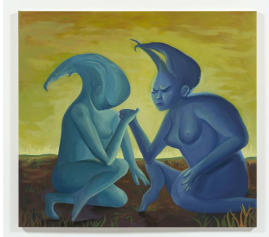
Yuma Radne Armwrestling , 2023 Oil on canvas 59 x 65 inches (150 x 165 cm) y.radne013122