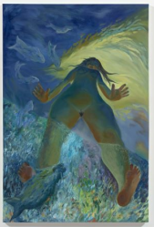
Yuma Radne From the eyes of a fish , 2023 Oil on canvas 65 x 43 1 / 4 inches (165 x 110 cm) y.radne013114