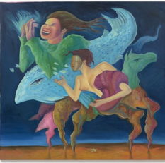
Yuma Radne If I had a voice, like a prancing saber , 2023 Oil on canvas 59 x 63 inches (150 x 160 cm) y.radne012993