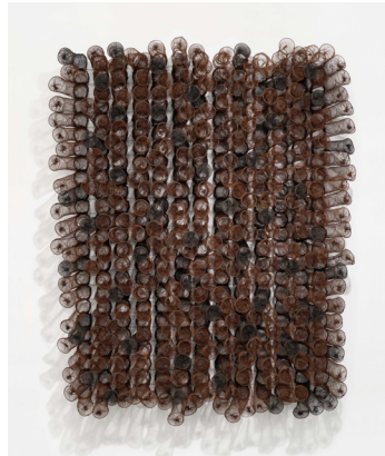
BRONWYN KATZ lhob l'amiro (striped back star) , 2023

Salvaged bedspring, pot scourers, spirits of salt, and wire 73 1/4 x 53 1/2 x 11 inches (186 x 136 x 28 cm.) (BRK23-005)