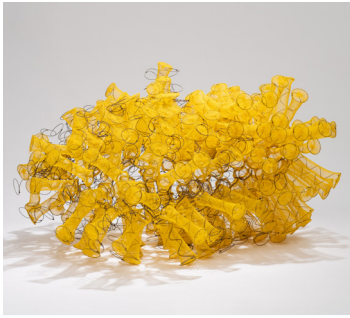
BRONWYN KATZ Sun-child (Sore l'os) , 2023

Salvaged bedspring, pot scourers, spirits of salt, and wire 72 x 64 1/8 x 37 3/4 inches (183 x 163 x 96 cm.) (BRK23-004)