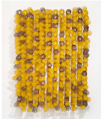
BRONWYN KATZ dao l'amiro (singed star) , 2023

Salvaged bedspring, pot scourers, spirits of salt, and wire 72 x 64 1/8 x 37 3/4 inches (183 x 163 x 96 cm.) (BRK23-004)