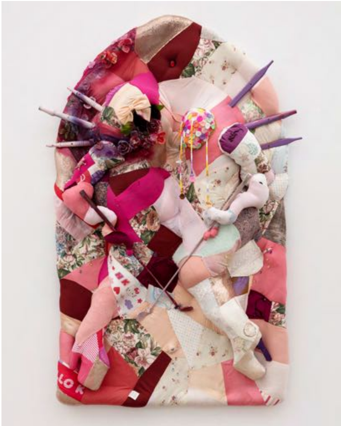
Sword-fight! , 2023. Fabric and sequins stretched on panel. 84 x 59 x 12 in.