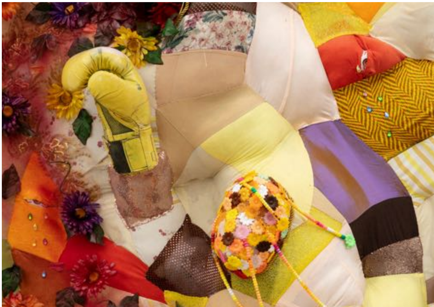
Lean with the left-lean with the left | LLeLow, 2023 Fabric and sequins stretched on panel. 84 x 50 x 16 in.