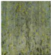
JH530, 2023 oil on linen 281.9 x 254 cm 111 x 100 in