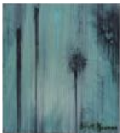
JH190BarnettNewman, 2023 oil on linen 281.9 x 254 cm 111 x 100 in