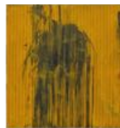
untitled, 2023 oil on linen 101.6 x 96.5 cm 40 x 38 in