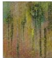
IDFK02, 2023 oil on linen 281.9 x 254 cm 111 x 100 in