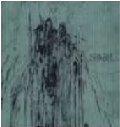
1946HJ, 2022 oil on linen 243.8 x 228.6 cm 96 x 90 in