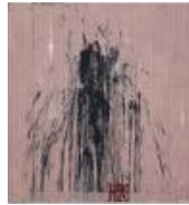
JH6243, 2023 oil on linen 152.4 x 144.8 cm 60 x 57 in