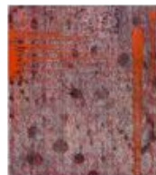
IDFK01, 2023 oil on linen 281.9 x 254 cm 111 x 100 in