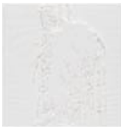
untitled, 2023 enamel on PLA 30.5 x 28.5 x 1 cm 12 x 11 1/4 x 3/8 in