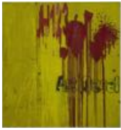
JH123Art|Basel, 2023 oil on linen 152.4 x 144.8 cm 60 x 57 in