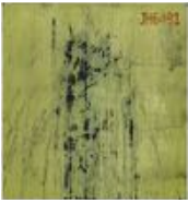
JH6491, 2022 oil on linen 243.8 x 228.6 cm 96 x 90 in