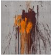
JH123091HJ, 2023 oil on linen 243.8 x 228.6 cm 96 x 90 in