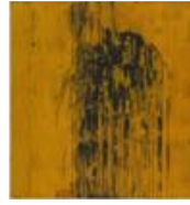
JH727, 2023 oil on linen 243.8 x 228.6 cm 96 x 90 in