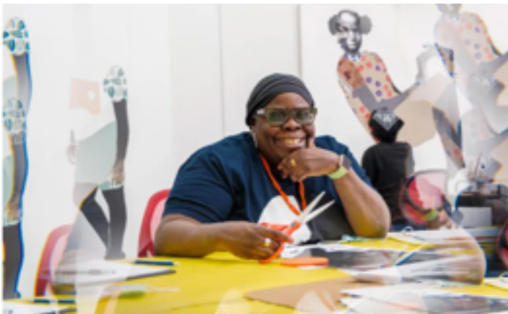
- DEBORAH ROBERTS -

Deborah Roberts was born in Austin, Texas, USA in 1962 where she continues to live and work. Combining collage with mixed media, Deborah Roberts' figurative works depict the complexity of Black subjecthood and explore themes of race, identity and gender politics.