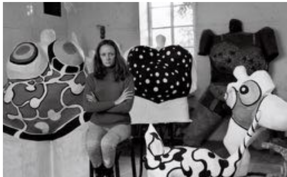
- NIKI DE SAINT PHALLE -

The artist's major touring exhibition 'I'm' opened at The Contemporary Austin, Texas in January 2021, following the installation of her first outdoor public mural there in September 2020. The show travelled to Museum of Contemporary Art Denver, Colorado; Art + Practice in collaboration with California African American Museum, Los Angeles, California and Cummer Museum of Art & Gardens, Jacksonville, Florida (2021–22).