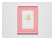
Pink, VII, 2023 pencil and pastel on paper in artist's frame 32.2 x 24.6 cm 12 5/8 x 9 3/4 in