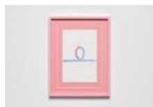
Pink, III, 2023 pencil and pastel on paper in artist's frame 32.2 x 24.6 cm 12 5/8 x 9 3/4 in