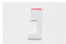
Text Image 7, 2023 Thanks For Telling Me acrylic on foam board and paper 61 x 26 x 2.5 cm 24 x 10 1/4 x 1 in