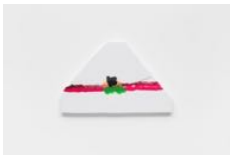
Text Image 11, 2023 It Takes Ben A Long Time acrylic on foam board and paper 39.5 x 61 x 2.5 cm 15 1/2 x 24 x 1 in