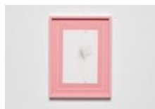
Pink, II, 2023 pencil and pastel on paper in artist's frame 32.2 x 24.6 cm 12 5/8 x 9 3/4 in