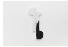
Text Image 2, 2023 acrylic on foam board and paper 60 x 27.5 x 2.5 cm 23 5/8 x 10 7/8 x 1 in