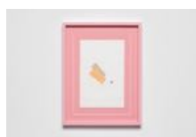
Pink, V, 2023 pencil and pastel on paper in artist's frame 32.2 x 24.6 cm 12 5/8 x 9 3/4 in