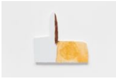
Text Image 9, 2023 That Yesterday And Down acrylic on foam board and paper 45.5 x 48 x 2.5 cm 17 7/8 x 18 7/8 x 1 in