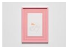
Pink, IX, 2023 pencil and pastel on paper in artist's frame 32.2 x 24.6 cm 12 5/8 x 9 3/4 in