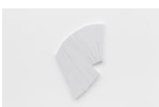
Text Image 1, 2023 acrylic on foam board and paper 65 x 39 x 2.5 cm 25 5/8 x 15 3/8 x 1 in