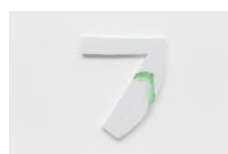
Text Image 8, 2023 Notice acrylic on foam board and paper 56 x 46 x 2.5 cm 22 x 18 1/8 x 1 in