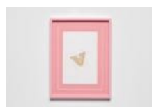
Pink, XI, 2023 pencil and pastel on paper in artist's frame 32.2 x 24.6 cm 12 5/8 x 9 3/4 in