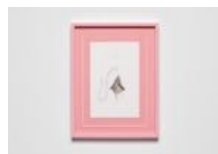
Pink, VIII, 2023 pencil and pastel on paper in artist's frame 32.2 x 24.6 cm 12 5/8 x 9 3/4 in