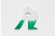
Text Image 10, 2023 Why Would You Say That acrylic on foam board and paper 46.5 x 46 x 2.5 cm 18 1/4 x 18 1/8 x 1 in