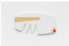
Text Image 12, 2023 Try Again acrylic on foam board and paper 32 x 61 x 2.5 cm 12 5/8 x 24 x 1 in