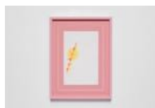
Pink, IV, 2023 pencil and pastel on paper in artist's frame 32.2 x 24.6 cm 12 5/8 x 9 3/4 in