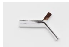
Text Image 5, 2023 Does It Make You Feel Happy acrylic on foam board and paper 43 x 61 x 2.5 cm 16 7/8 x 24 x 1 in