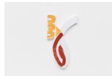
Text Image 4, 2023 After acrylic on foam board and paper 60 x 34 x 2.5 cm 23 5/8 x 13 3/8 x 1 in