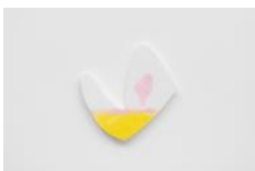
Text Image 14, 2023 All The Instructions Start acrylic on foam board and paper 44 x 42 x 2.5 cm 17 3/8 x 16 1/2 x 1 in