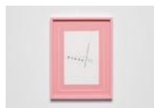
Pink, X, 2023 pencil and pastel on paper in artist's frame 32.2 x 24.6 cm 12 5/8 x 9 3/4 in