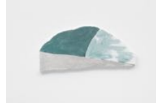
Text Image 3, 2023 Hug Sum acrylic on foam board and paper 30 x 62 x 2.5 cm 11 3/4 x 24 3/8 x 1 in