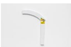
Text Image 15, 2023 I'm Stuck acrylic on foam board and paper 59 x 40 x 2.5 cm 23 1/4 x 15 3/4 x 1 in