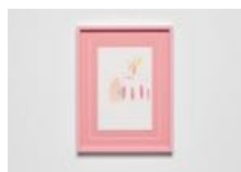
Pink, I, 2023 pencil and pastel on paper in artist's frame 32.2 x 24.6 cm 12 5/8 x 9 3/4 in