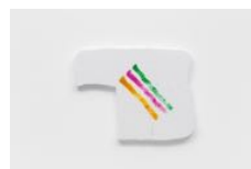
Text Image 6, 2023 If I Do acrylic on foam board and paper 37 x 49 x 2.5 cm 14 5/8 x 19 1/4 x 1 in