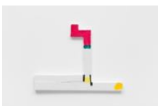
Text Image 13, 2023 This Is Not A Time For Music acrylic on foam board and paper 46 x 61 x 2.5 cm 18 1/8 x 24 x 1 in