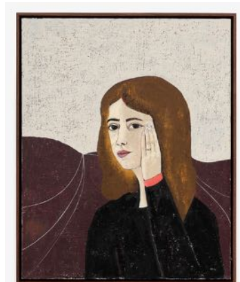
CLARE ROJAS Portrait of Blushing , 2018

Oil on linen 16 x 12 inches (40.6 x 30.5); 17 1/8 x 13 1/8 x 1 5/8 inches (43.5 x 33.3 x 4.1 cm.) (CLR23-006)