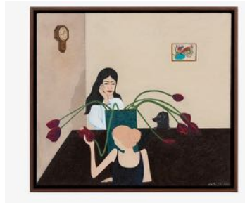
CLARE ROJAS It all fell down , 2023

Oil on linen 7 x 10 inches (17.8 x 25.4 cm.); 8 x 11 x 1 5/8 inches (20.3 x 27.9 x 4.1 cm.) framed (CLR23-001)