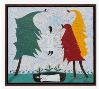
CLARE ROJAS Rainbow light healing energy from the trees , 2023

Oil on linen 15 1/2 x 17 1/2 inches (39.4 x 44.5 cm.); 16 1/8 x 18 1/8 x 1 1/2 inches (41 x 46 x 3.8 cm.) framed (CLR23-004)