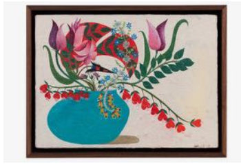
CLARE ROJAS Bouquet eye , 2018

Oil on linen 7 x 10 inches (17.8 x 25.4 cm.); 8 x 11 x 1 5/8 inches (20.3 x 27.9 x 4.1 cm.) framed (CLR23-001)