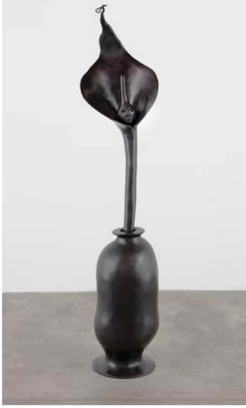
CLARE ROJAS Emmanuelle (The Lord is Among Us) , 2023

Bronze 86 x 20 x 20 inches (218.4 x 50.8 x 50.8 cm.) (CLR23-003)