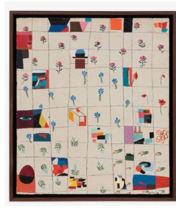
CLARE ROJAS Abstract and Flower , 2023

30 x 24 inches (76.2 x 61 cm.); 31 1/8 x 25 1/8 x 1 3/4 inches (79.1 x 63.8 x 4.4 cm.) framed (CLR22-077)