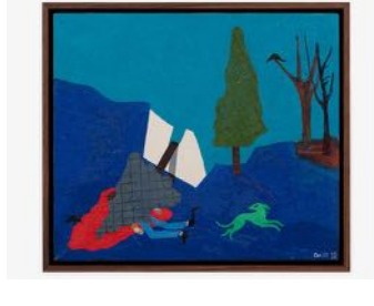
CLARE ROJAS A Tree Fell , 2022

Oil on linen 24 x 30 inches (61 x 76.2 cm.); 25 1/8 x 31 1/4 x 2 1/8 inches (63.8 x 79.4 x 5.4 cm.) framed (CLR22-066)