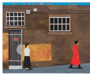
CLARE ROJAS The Bus Stop , 2023

Oil on linen 15 x 13 inches (38.1 x 33 cm.); 6 1/16 x 14 1/16 x 1 5/8 inches (40.8 x 35.7 x 4.1 cm.) framed (CLR23-005)