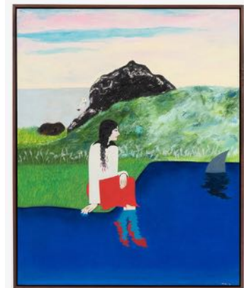
CLARE ROJAS Sharks Point , 2023

Oil on linen 13 x 15 inches (33 x 38.1 cm.) (CLR22-071)