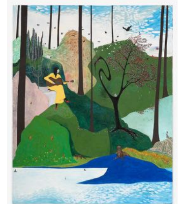
CLARE ROJAS The Sacred Bird Tree , 2022

Oil on linen 50 x 40 inches (127 x 101.6 cm.); 51 1/2 x 41 1/2 x 2 1/8 inches (130.8 x 105.4 x 5.4 cm.) framed (CLR22-075)