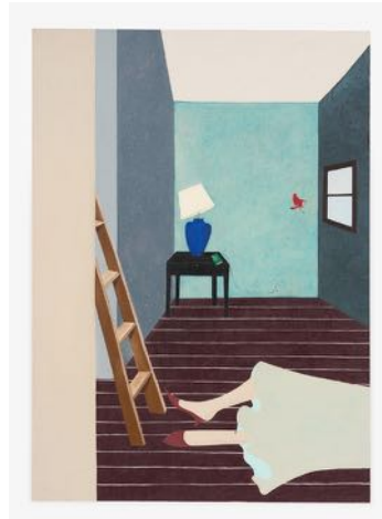
CLARE ROJAS They Were Both Stuck Inside , 2022

Oil on linen 16 x 18 inches (40.6 x 45.7 cm.); 17 1/4 x 19 1/4 x 1 3/4 inches (43.8 x 48.9 x 4.4 cm.) framed (CLR23-002)