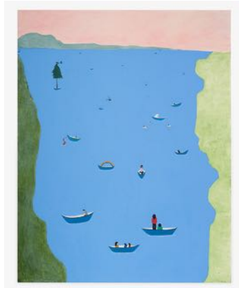
CLARE ROJAS We Are All in the Same Boat , 2023

Oil on linen 15 1/2 x 17 1/2 inches (39.4 x 44.5 cm.); 16 1/8 x 18 1/8 x 1 1/2 inches (41 x 46 x 3.8 cm.) framed (CLR23-004)