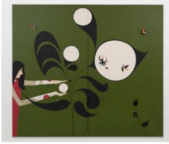
CLARE ROJAS The Glowing Night Shade , 2022

Acrylic and gouache on panel 84 x 96 inches (213.4 x 243.8 cm.) (CLR22-068)