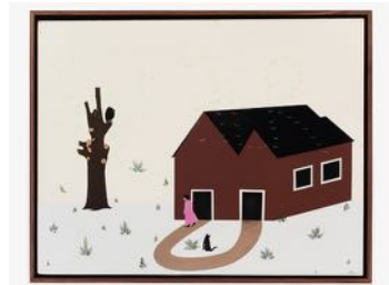
CLARE ROJAS Her world got smaller , 2022

Oil on linen 60 x 43 1/8 inches (152.4 x 109.5 cm.) (CLR22-064)