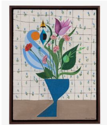
CLARE ROJAS I'm still pretty bouquet , 2023

Acrylic and gouache on panel 29 5/8 x 37 3/4 inches (75.2 x 95.9 cm.); 31 3/8 x 39 5/8 x 2 1/2 inches (79.7 x 100.6 x 6.3 cm.) framed (CLR22-069)