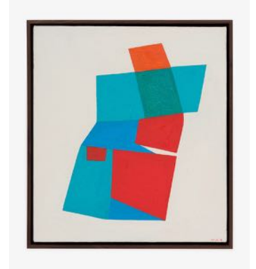
CLARE ROJAS The Part That You Can See Through , 2022

Oil on linen 40 x 50 inches (101.6 x 127 cm.) (CLR22-072)