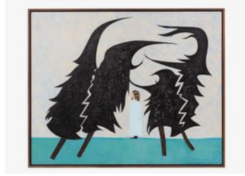
CLARE ROJAS When The Trees Were Fighting , 2023

Oil on linen 50 x 40 inches (127 x 101.6 cm.); 51 1/2 x 41 1/2 x 2 1/8 inches (130.8 x 105.4 x 5.4 cm.) framed (CLR22-074)