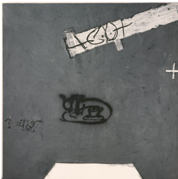
Tassa sobre gris , 2001 Mixed media on wood 78 3/4 x 78 3/4 in.