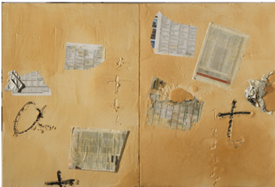
Materia i diaris , 2009 Mixed media and collage on wood 51 1/8 x 76 1/2 in.