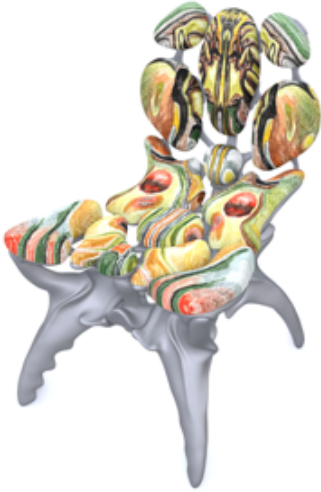
The Ever Sessile Pupa [drawing], 2022