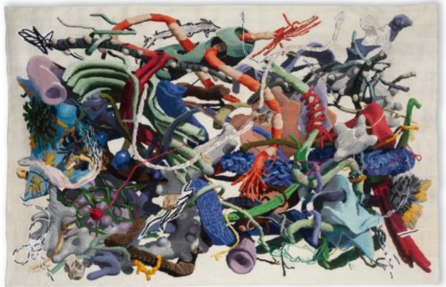
Swatching Space Time, 2023

Opening Reception: Saturday, April 29 th , 2 – 5pm