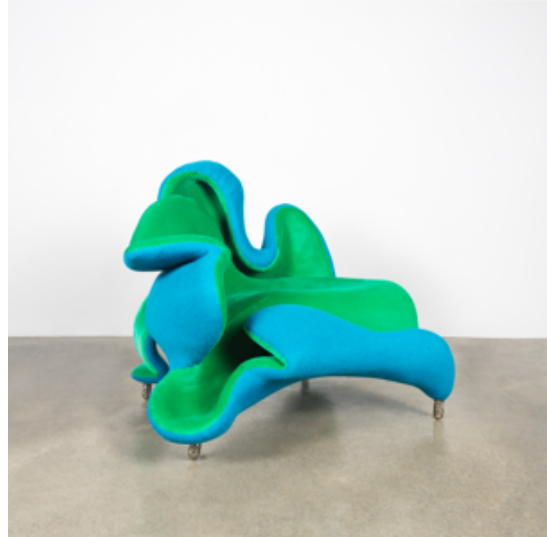
Ammonoid Beta, 2020