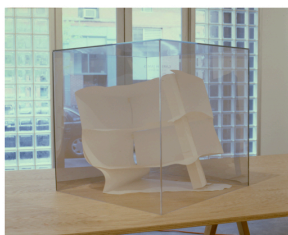
Jerusalem, May 2001 2004