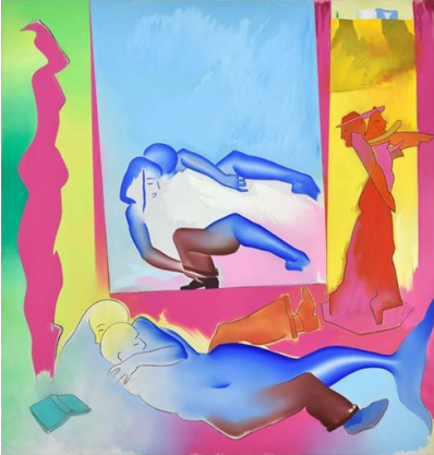
Allen Jones, The Studio, 1985 - Oil on canvas - 244 x 233 cm, 96 x 92 in

Born in 1937, Allen Jones is one of Britain's most distinguished artists from the pioneering Pop Movement. In the early 1970s, the artist brought an international sensation with his provocative fiberglass sculptures. According to curator and art historian Sir Norman Rosenthal, "Allen Jones draws his huge knowing aesthetic strength from the classical past while engaging in a critical and celebratory exercise of contemporary human relations between the sexes."