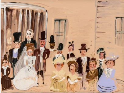
Genieve Figgis, Wedding , 2022 - Acrylic on panel - 64 x 84 cm, 25 x 33 in / © Genieve Figgis - Courtesy of the Artist and Almine Rech - Photo: Nicolas Brasseur

Born in 1972 in Dublin, Ireland , Genieve Figgis now lives and works in County Wicklow, Ireland . Her paintings share a similar dramatic bent as some Irish-English literature subjects from Edgar Allan Poe to Oscar Wilde, as well as acknowledged Old Masters such as Goya. Working in oil and acrylic and at small-to mid-scale, Genieve Figgis produces paintings rich in color, texture, humor, and the macabre. Through her work, she explores and sends-up the idealization of luxury and leisure in paintings and photographs throughout art history. Like these historical works, her paintings feature sumptuous domestic interiors and stately country homes, idyllic natural settings, and protagonists dressed in finery and engaged in such activities as feasting, horseback riding, playing piano, or attending a party. Figgis's body of work also includes her take on the tradition of portraiture and the odalisque. In her compositions, however, all is not well. Her figures appear either faceless or as foolishly grinning, ghoul-like creatures, whose loosely rendered forms seem vulnerable and insubstantial as they merge with their lushly painted, semi-abstract surroundings.