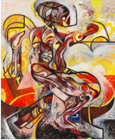
Zio Ziegler, Gesture and Shadow , 2022 - Oil and pumice on canvas -172.7 x 142.2 x 5.1 cm, 68 x 56 x 2 in

Born in 1988 in California, USA, Zio Ziegler paints from a meditative state, drawing from his subconscious a personal interpretation of the world around him. For him, painting is an act of self-exploration and a radical expression of vulnerability. "Painting is my attempt at self-understanding - rather than finding a concept and executing it in a linear fashion, I react to my questions, life, and awareness," he claims. The focus of Ziegler's practice aims to illuminate the process of creating instead of isolating the final result. His images of monumental figures set in motion serve as a portal of sorts for the viewer, inviting them to perceive the work in their own way, and in turn creating an active exchange between the artist and the audience.