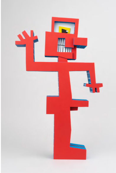
Kenny Scharf, HI GUY!, 1986-2021 - Painted Aluminum - 60 x 40.2 x 9.3 cm, 23 1/2 x 15 3/4 x 3 3/4 in

Kenny Scharf (b. 1958, United States) is a renowned artist affiliated with the 1980's East Village Art movement in New York . Scharf developed a distinct and uniquely personal artistic style alongside his mentor Andy Warhol, and contemporaries like Jean-Michel Basquiat and Keith Haring with whom he pioneered contemporary street art. His multifaceted practice—spanning painting, sculpture, installation work, murals, performance and fashion—reflects his dedication to the creation of dynamic forms of art that deconstruct existing artistic hierarchies, echoing the philosophy of Pop artists. Yet Scharf's artistic significance expands beyond the art historical terrain of Pop Art; the artist instead coined the term “Pop Surrealist” to describe his one-of-a-kind practice. His inclusion in the 1985 Whitney Biennial marked the start of his international phenomenon, a reputation that continues to thrive today.