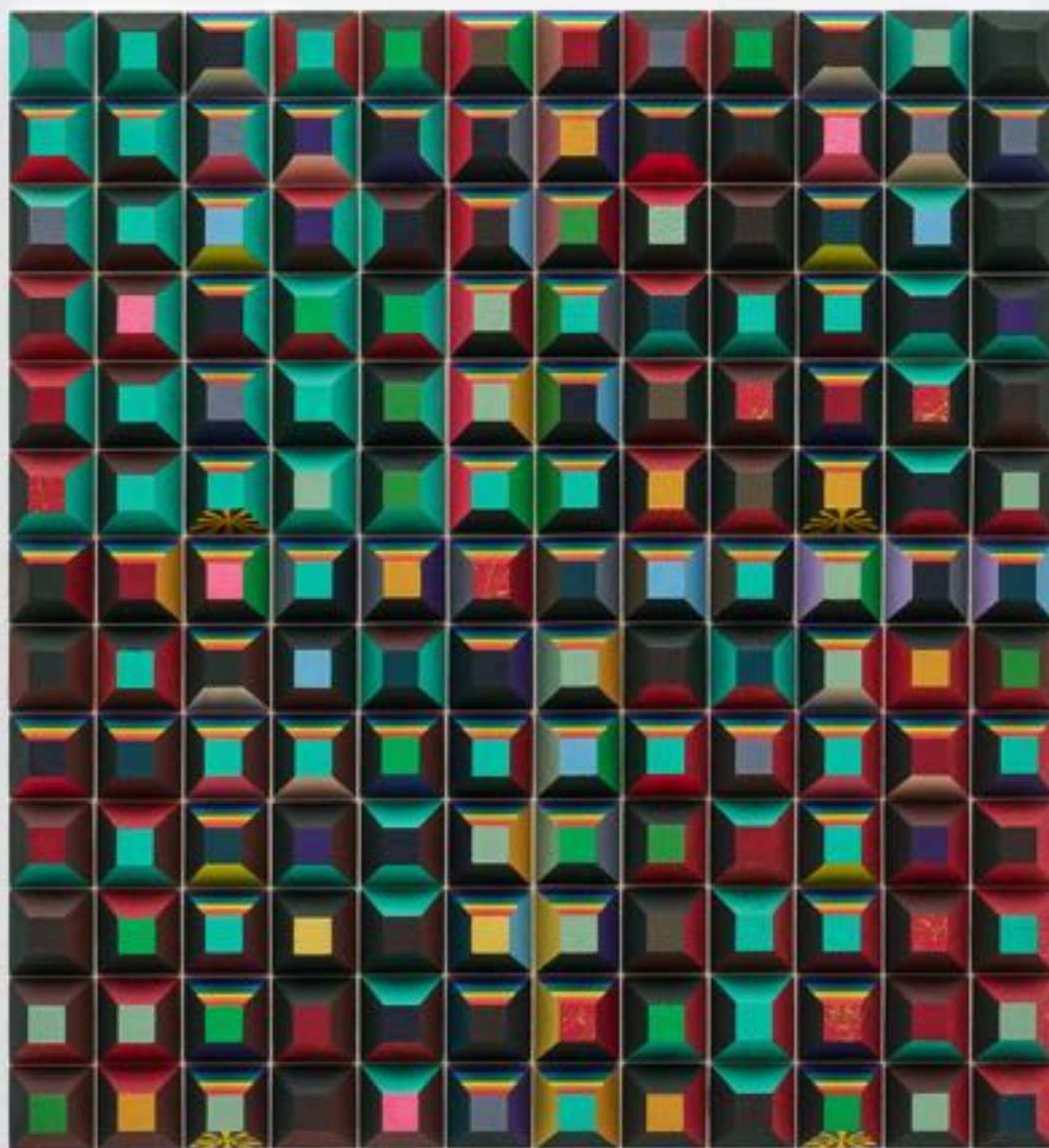
Water Tablet / Emperor Scale, 2022 wood, aqua-resin, flashe, acrylic 40.6 × 36.8 × 6.3 cm, 16 × 14 ½ × 2 ½ in.