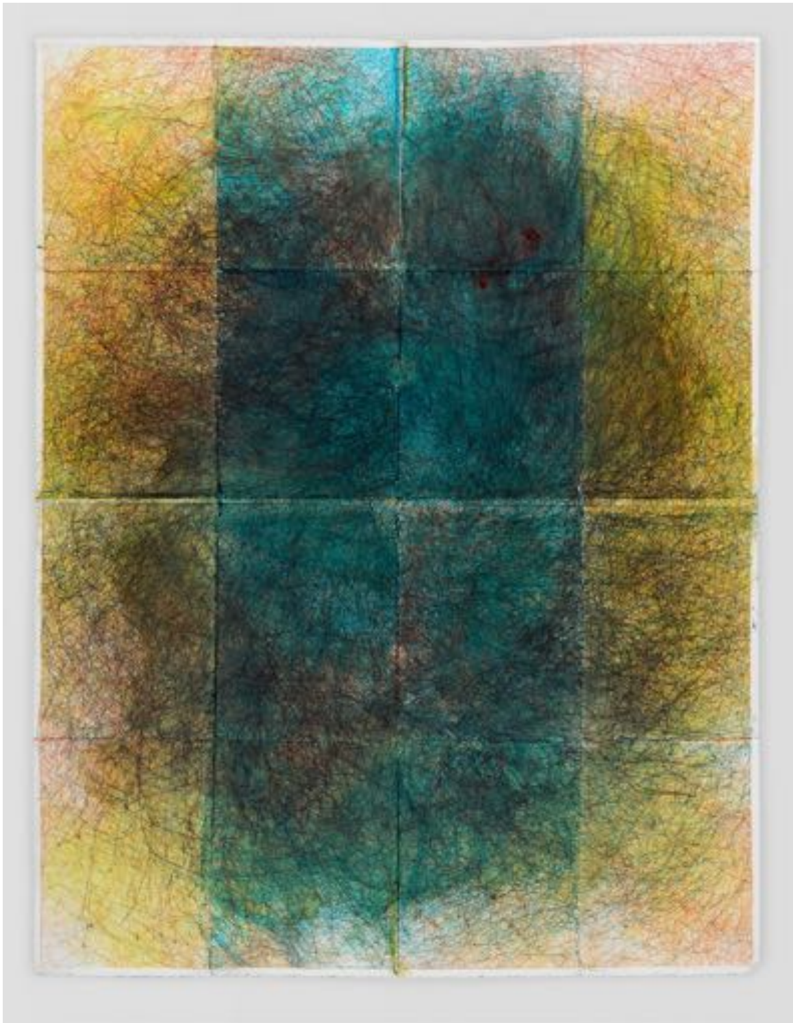
Automatic Drawing April 2022, 2022 ink on paper 132.1 × 101.6 cm, 52 × 40 in.