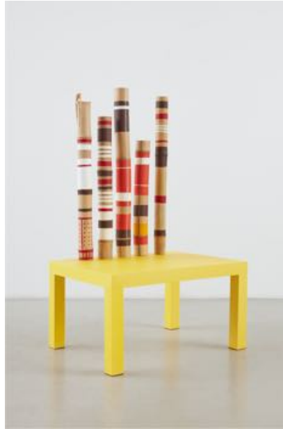
Germinal Seats , 2022