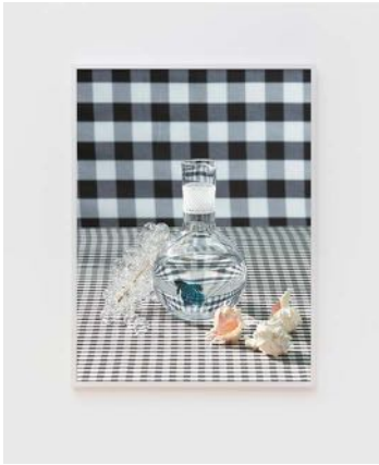
ROE ETHRIDGE Decanter with Fish, 2022

Dye sublimation print on aluminum 31 1/4 x 24 inches (79.4 x 61 cm.) Edition of 5 plus 2 artist's proofs (RE22-007)