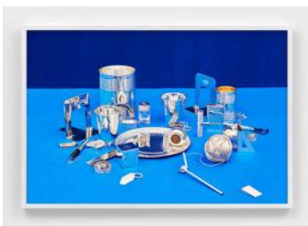
ROE ETHRIDGE Tiffany Silver Still Life, 2022

Dye sublimation print on aluminum 40 x 60 inches (101.6 x 152.4 cm.) Edition of 5 plus 2 artist's proofs (RE22-021)