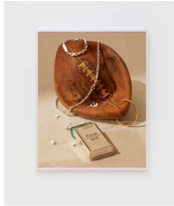
ROE ETHRIDGE Football and First Aid for Tiffany, 2022

Dye sublimation print on aluminum 32 x 24 inches (81.3 x 61 cm.) Edition of 5 plus 2 artist's proofs (RE22-008)