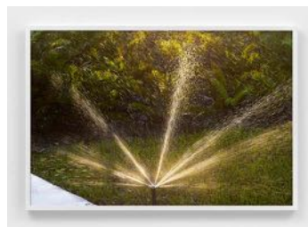
ROE ETHRIDGE Sprinkler at Dawn in Palm Beach, 2022

Dye sublimation print on aluminum 40 x 30 inches (101.6 x 76.2 cm.) Edition of 5 plus 2 artist's proofs (RE22-014)