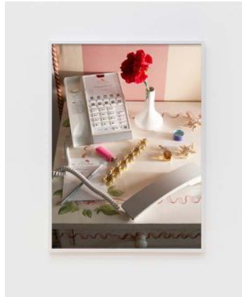
ROE ETHRIDGE Desk in room 401 at The Chesterfield, Palm Beach, 2022

Dye sublimation print on aluminum 31 1/4 x 24 inches (79.4 x 61 cm.) Edition of 5 plus 2 artist's proofs (RE22-007)