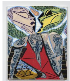
Shohei Takasaki Untitled (December 12, 2022), 2022 Oil stick, acrylic and charcoal on canvas 64 x 51 inches (162.6 x 129.5 cm) s.takasaki012714