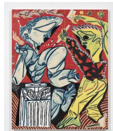
Shohei Takasaki Untitled (December 9, 2022), 2022 Oil stick, acrylic and charcoal on canvas 64 x 51 inches (162.6 x 129.5 cm) s.takasaki012713