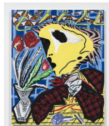
Shohei Takasaki Untitled (December 5, 2022), 2022 Oil stick, acrylic and charcoal on canvas 64 x 51 inches (162.6 x 129.5 cm) s.takasaki012711