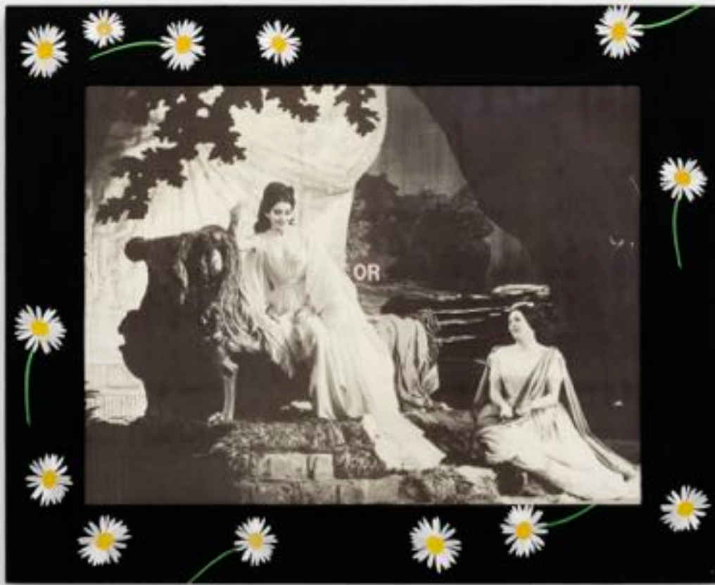
OR-ca , 1994 Photo on linen, embroidery & felt H 58 x 73 in