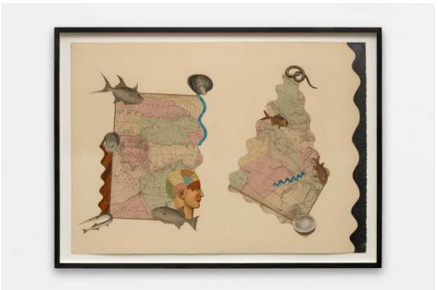
EDGE , 1979 Graphite and collage on paper H 30 x 41 ½ in