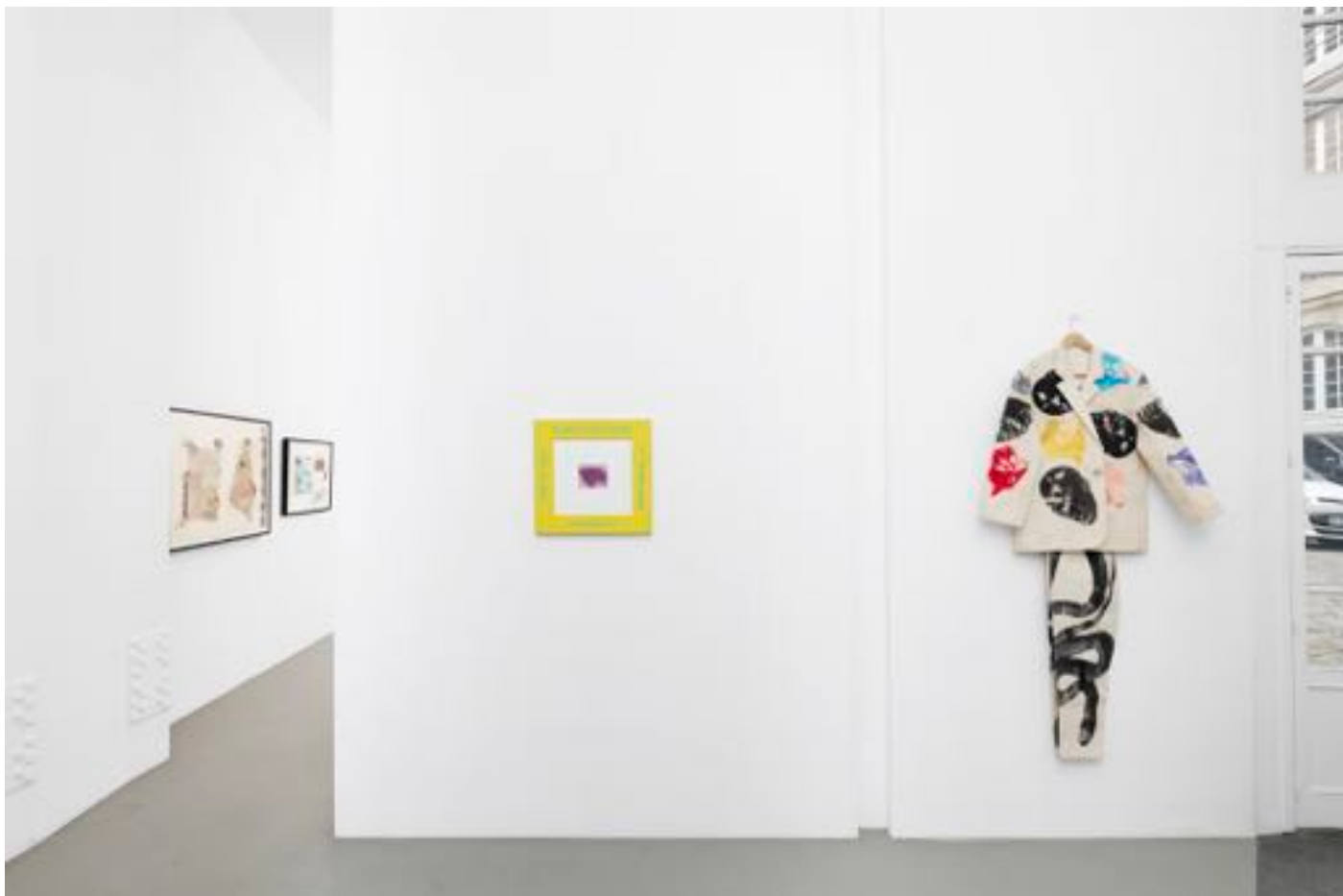
Radiant Darkness , exhibition views at Galerie Mitterrand, Paris, France, 7 jan - 4 mar 2023