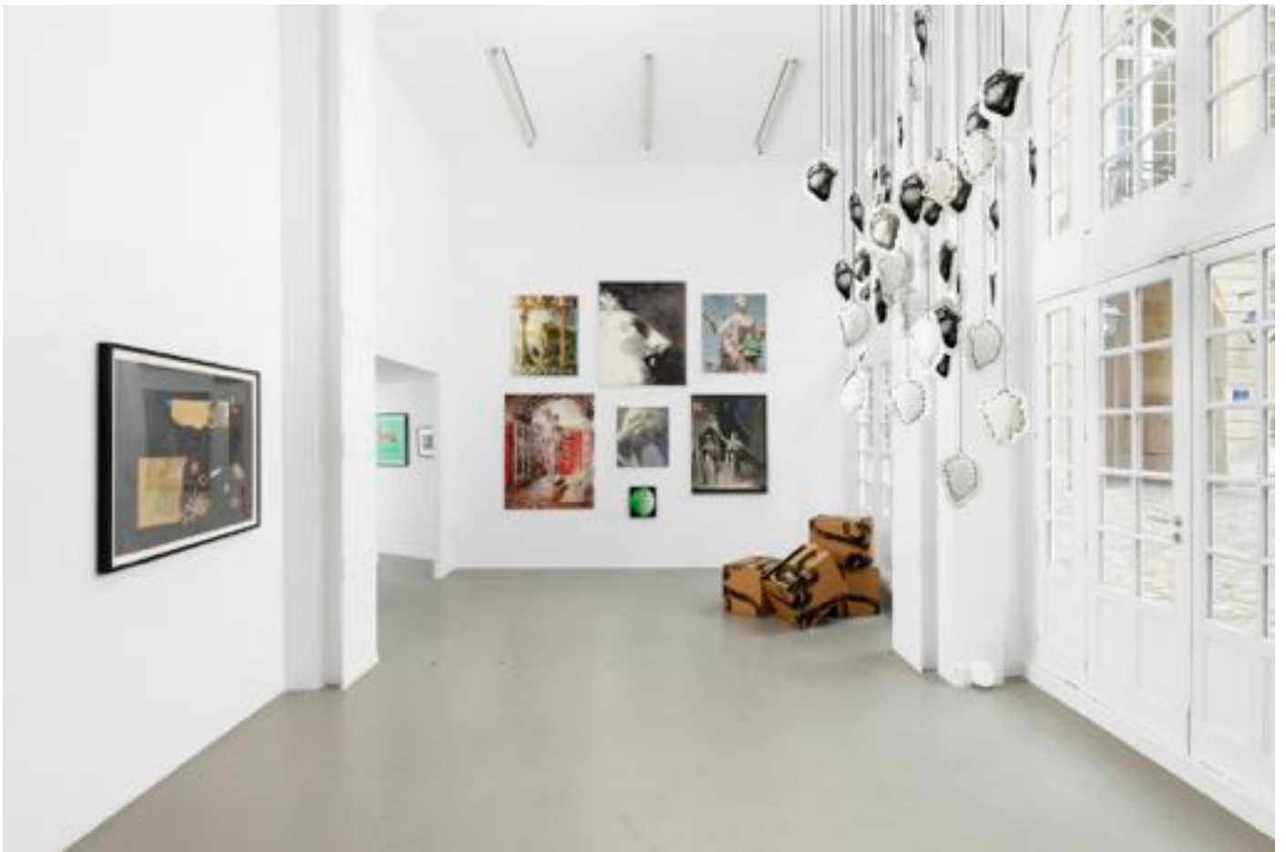
Radiant Darkness , exhibition views at Galerie Mitterrand, Paris, France, 7 jan - 4 mar 2023