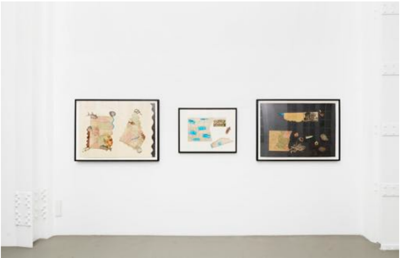
Radiant Darkness , exhibition views at Galerie Mitterrand, Paris, France, 7 jan - 4 mar 2023