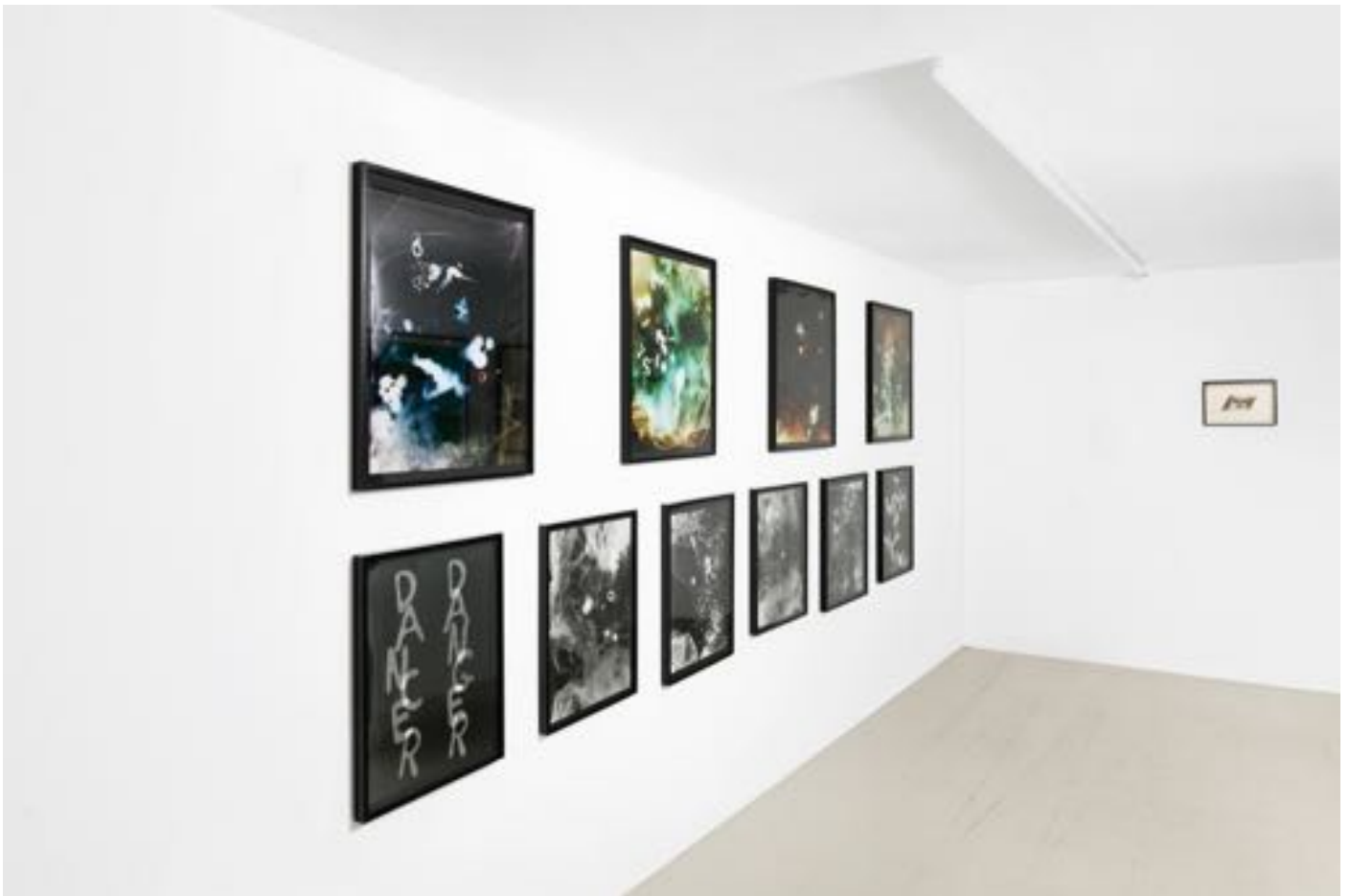
Radiant Darkness , exhibition views at Galerie Mitterrand, Paris, France, 7 jan - 4 mar 2023