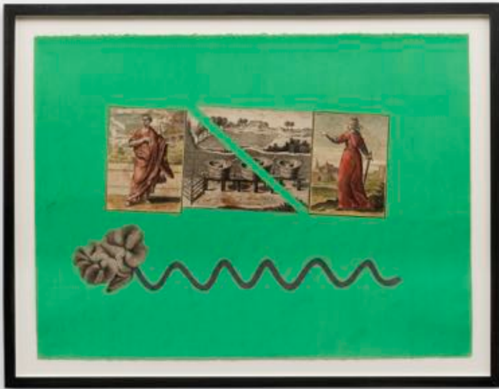
SPLIT , 1979 Oil stick, graphite and collage on paper H 55,9 x 76,2 cm