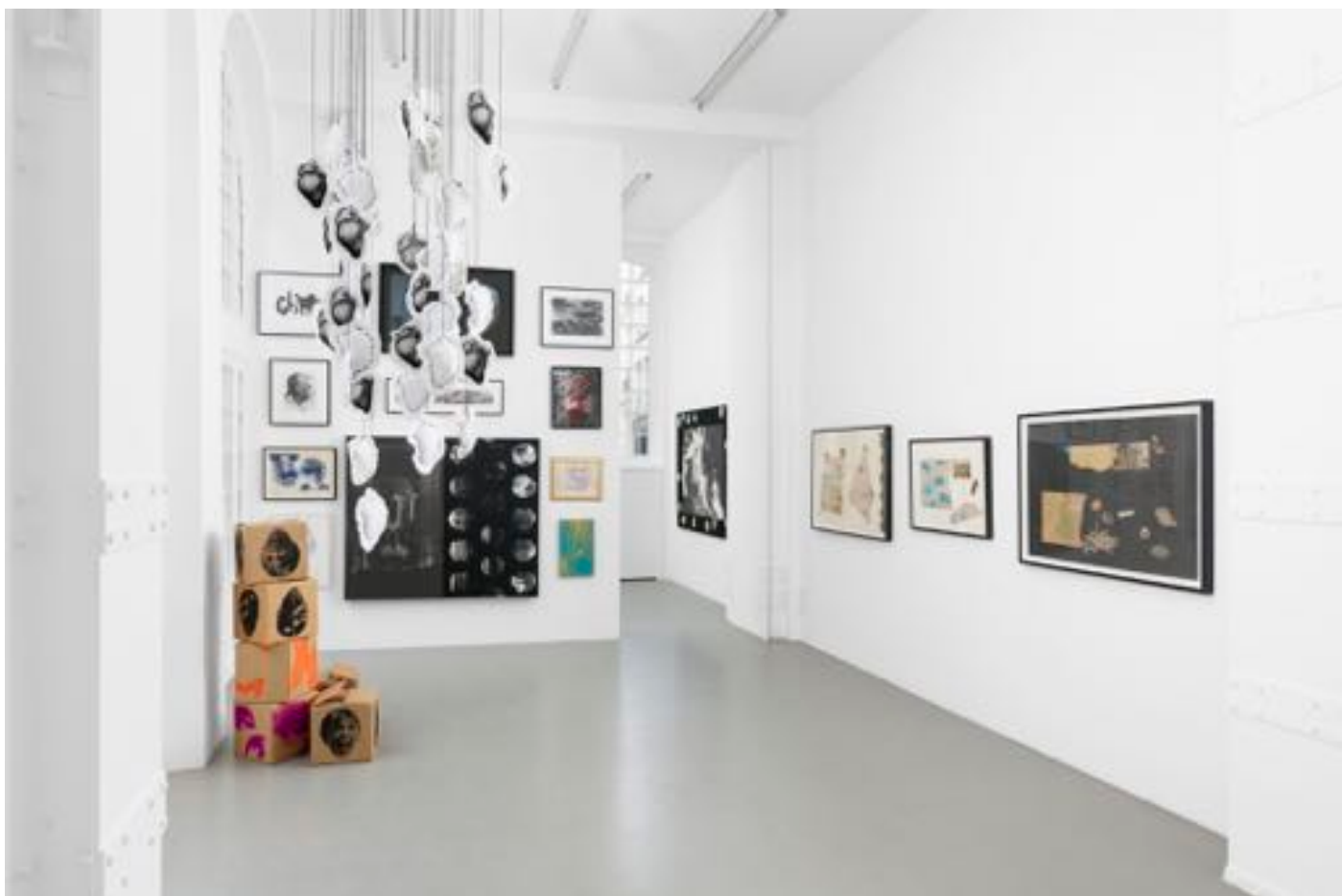
Radiant Darkness , exhibition view at Galerie Mitterrand, Paris, France, 7 jan - 4 mar 2023