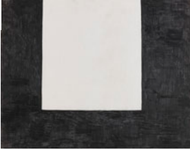
Al Held (1928 - 2005) GP 3 Circa 1965 Graphite on paper 20 x 26 inches 50.8 x 66 centimeters Titled on verso: GP 3. CR# He.31856