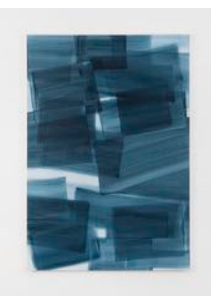
Shim Moon-Seup. The Presentation, 2015. Acrylic on canvas. 162 \times 112.5 cm | 63 3/4 \times 44 5/16 in. Courtesy of the artist and Perrotin.