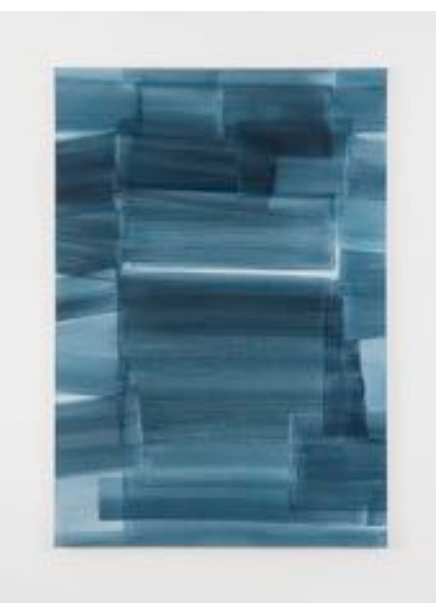
Shim Moon-Seup. The Presentation, 2015. Acrylic on canvas. 162.5 \times 113 cm | 64 \times 44 1/2 in. Courtesy of the artist and Perrotin.