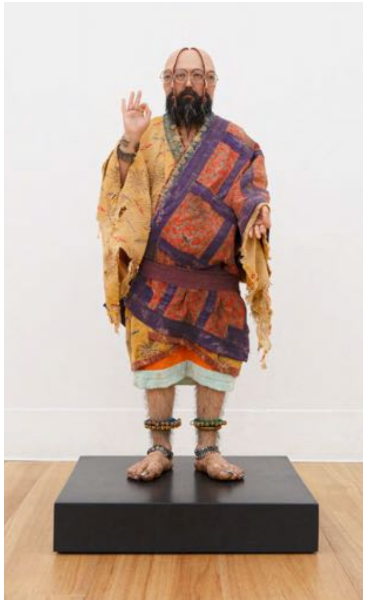
Untitled, 2017. Silicon, FRP, 70 × 35 × 35 cm. 1/5 Editions + 2 AP. ©2017 Takashi Murakami/Kaikai Kiki Co., Ltd. All Rights Reserved. Courtesy Perrotin.

Lastly, the robot sculpture Arhat completes this exhibition. This ironic self-portrait refers to the theme of the Arhats –the clairvoyant disciples of Buddha– that Murakami has been exploring for the past ten years with the monumental painting The 500 Arhats created for his retrospective in Qatar in 2012.