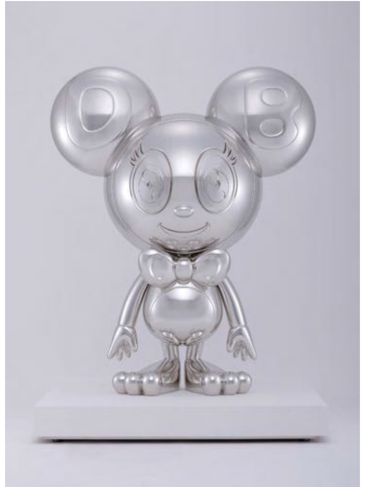
Mr. DOB (Platinum), 2019 - 2022. Platinum leaf on FRP, 173,4 x 130,4 x 130 cm (including pedestal). ©2019 - 2022 Takashi Murakami/Kaikai Kiki Co., Ltd. All Rights Reserved.