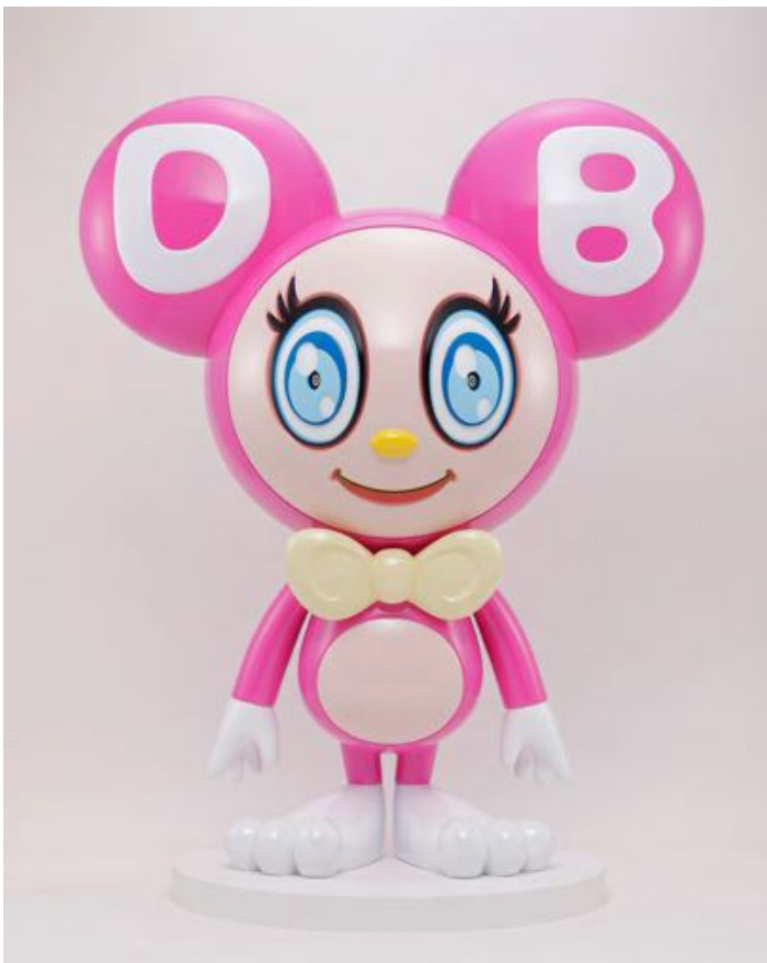
DOB (pink). FRP, urethane paint, stainless steel, wood, 87,1 × 68,8 × 47 cm (including pedestal). 20 Editions + 2 AP + 2 SP AP1 or SP1.

The exhibition opens with a series of sculptures and paintings dedicated to Mr. DOB , the artist's iconic character created in 1993. Mr. DOB's design was inspired by several animated figures such as Doraemon, Sonic and Mickey Mouse. His name is a diminutive of the expression "dobojite" meaning "why" in Japanese slang. Mr. DOB has undergone many transformations over the years, but is still recognizable by the letters of his name on his face and ears. Accompanying Takashi Murakami in his existential questioning, the DOB character has developed a complex psychology, to the point of becoming the artist's avatar.