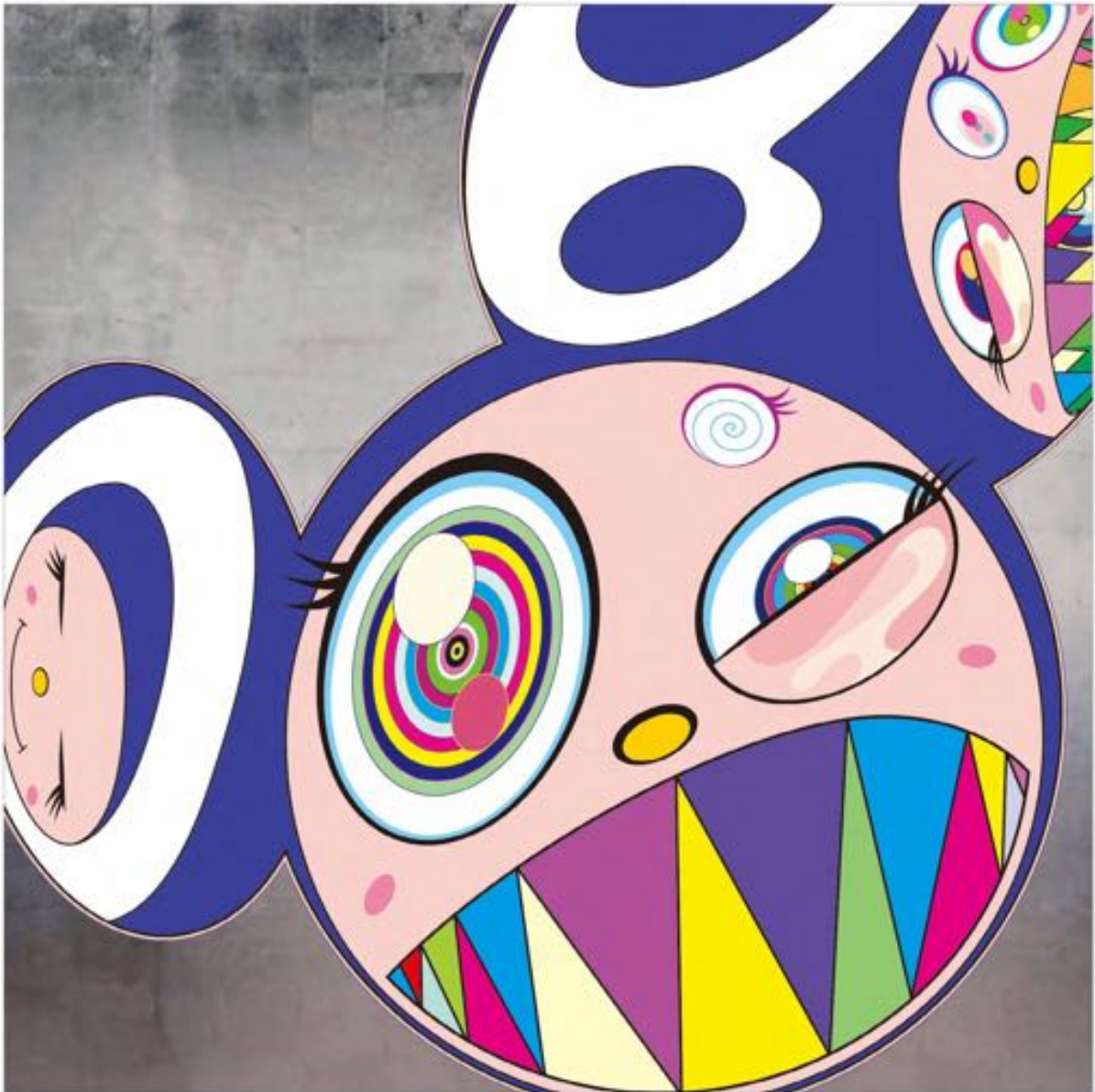
Untitled, 2022. Acrylic on canvas, 100 × 100 cm. ©2022 Takashi Murakami/Kaikai Kiki Co., Ltd. All Rights Reserved.