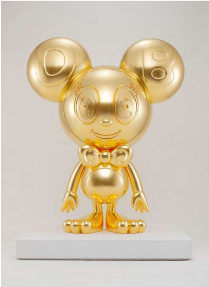
DOB (Gold), 2019 - 2020. Gold leaf on FRP, 158,4 × 130,4 × 82,8 cm. ©2019 - 2020 Takashi Murakami/Kaikai Kiki Co., Ltd. All Rights Reserved.