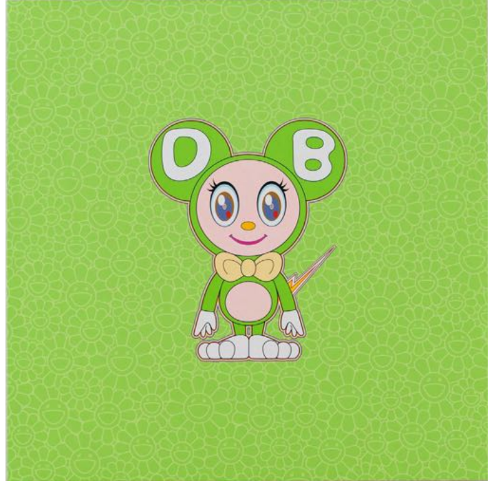
Untitled, 2020. Acrylic on canvas mounted on aluminium frame, 100 × 100 cm. ©2020 Takashi Murakami/Kaikai Kiki Co., Ltd. All Rights Reserved. Courtesy Perrotin.

Also on view: new paintings from the body of work Murakami.Flowers . A component of NFT project Murakami.Flowers, the pixelated flower paintings by Takashi Murakami combine the artist's iconic Superflat aesthetic with the nostalgia of the graphics of 1970's Japanese games. The series was conceived around the key number 108 associated with the Buddhist principle of bonnō , or earthly temptations; 108 backgrounds, 108 flower colors, 108 fields. As the artist states, "The existence of Murakami.Flowers extends beyond blockchain." Each flower of this series is unique, crafted by hand and required thousands of hours of work. Through the adaptation of an NFT into the real world, the artist bridges the physical and digital realms in order to trigger a cognitive revolution.