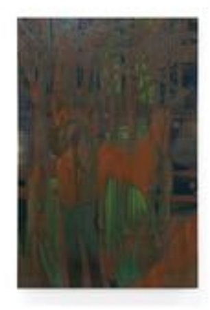
HENRY SHUM Lunar pilgrimage, 2022

Oil on canvas 78 3/4 x 52 3/8 inches (200 x 133 cm.) (HES22-010)