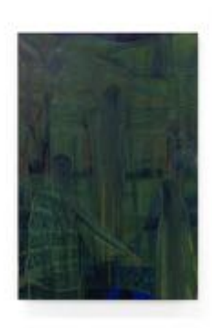
HENRY SHUM Maar, 2022

Oil on canvas 47 1/4 x 31 1/2 inches (120 x 80 cm.) (HES22-003)