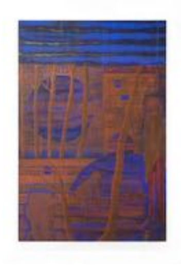
HENRY SHUM Circles (of Woman and Man), 2022

Oil on canvas 47 1/4 x 31 1/2 inches (120 x 80 cm.) (HES22-002)