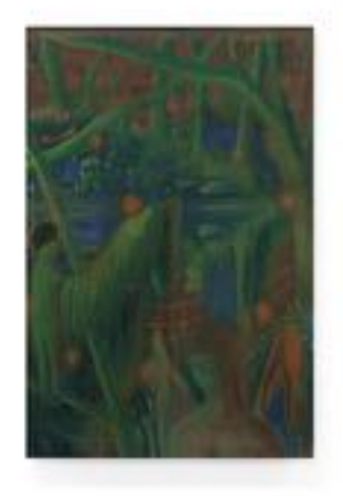
HENRY SHUM Shapeshift (Long to Disremember), 2022

Oil on canvas 70 7/8 x 47 1/4 inches (180 x 120 cm.) (HES22-007)