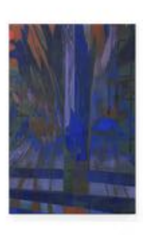
HENRY SHUM Illusion of Illusion, 2022

Oil on canvas 78 3/4 x 52 3/8 inches (200 x 133 cm.) (HES22-006)