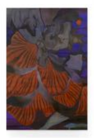
HENRY SHUM Away Thoroughly from Dust and Echoes, 2022

Oil on canvas 35 \, 3/8 \, x \, 23 \, 5/8 \, inches (90 \, x 60 cm.) (HES22-005)