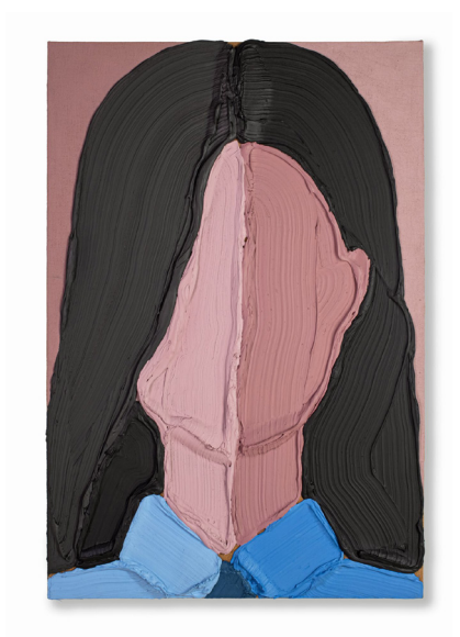
José Lerma, Lisa , 2022 - Acrylic on burlap - 182.9 x 121.9 cm / 72 x 48 in/ © José Lerma - Courtesy of the Artist and Almine Rech - Photo: Raguel Pérez Puig

Almine Rech Shanghai is pleased to present José Lerma's first solo show at the gallery, and his first solo exhibition in China. The show will be on view from December 09, 2022 to January 07, 2023.