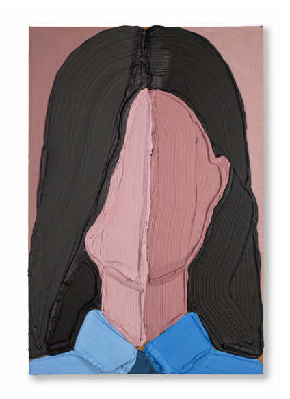
José Lerma, Lisa , 2022 - Acrylic on burlap - 182.9 x 121.9 cm / 72 x 48 in / @ José Lerma

three-dimensional and flat, organic and synthetic, living and unmoving, portrait and landscape, small and big. Though seemingly placid, Lerma's portraits shuttle between these poles and subtly disrupt our assumptions about what we see so that we may return to an open, curious, childlike state of mind.