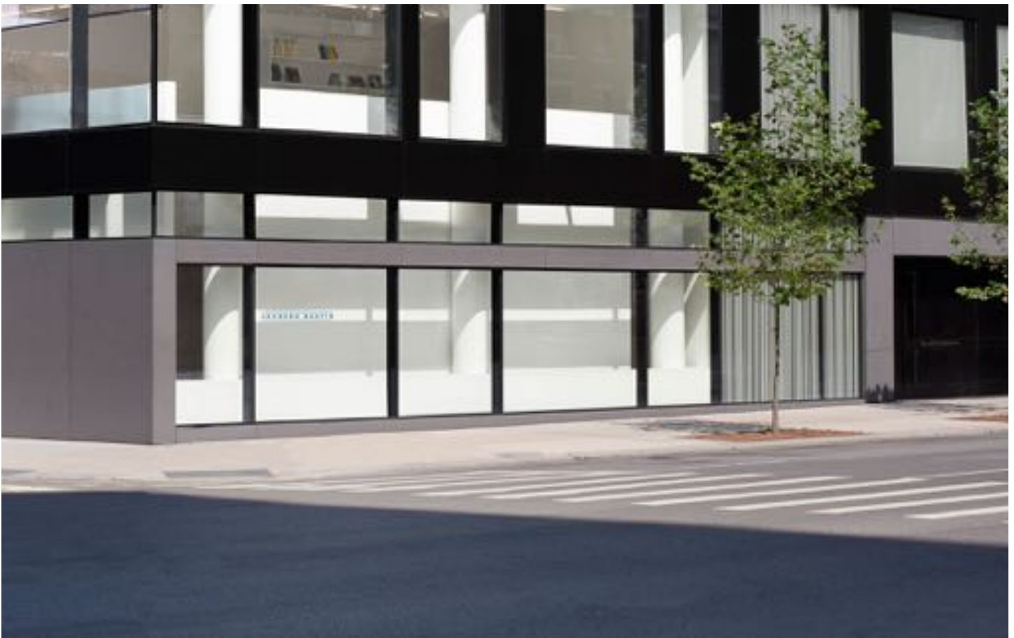
Lehmann Maupin in New York.