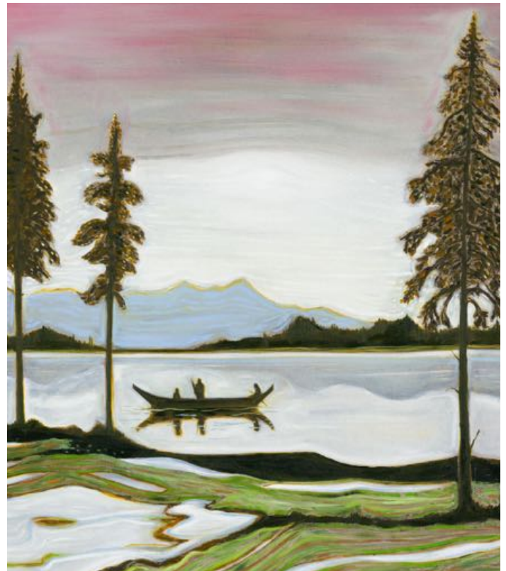
Billy Childish, puget fisherman , 2022 (detail).

Childish has labeled himself a "radical traditionalist" and his dedication to representational oil painting has remained unshakable across his career, regardless of the medium's popularity or position within contemporary artistic discourse. He has maintained an anti-establishment, anti-authority stance, and resolutely resisted any connection with particular groups or artistic movements, identifying instead with artists who worked outside of these confines, such as Vincent van Gogh, Kurt Schwitters, and Edvard Munch. Childish fundamentally considers artistry to be the sacred inheritance of every human being, and exhorts everyone to create, stating: "If you're born here, and you're here on earth, you are meant to express certain things—you can be a vehicle of collective consciousness."