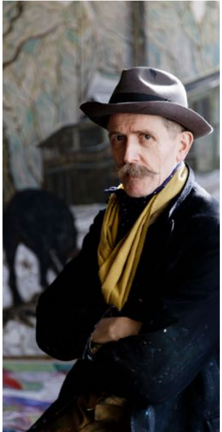
Billy Childish, 2020.