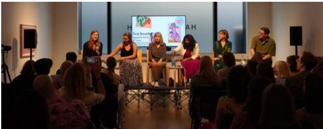
First Breaths Talk at Hauser & Wirth, June 2022

A multidisciplinary symposium that takes the work of Hospital Rooms as a departure point to consider and critically reflect upon the spaces we work in and the communities we work with. This symposium will facilitate conversations that engage with how artistic processes, and participating in the creation of an artwork, can empower and elicit moments of reflection and exchange alongside an exploration and discussion as to how permanent installations and artworks interact with and affect the environment and encounters with a locked mental health ward.