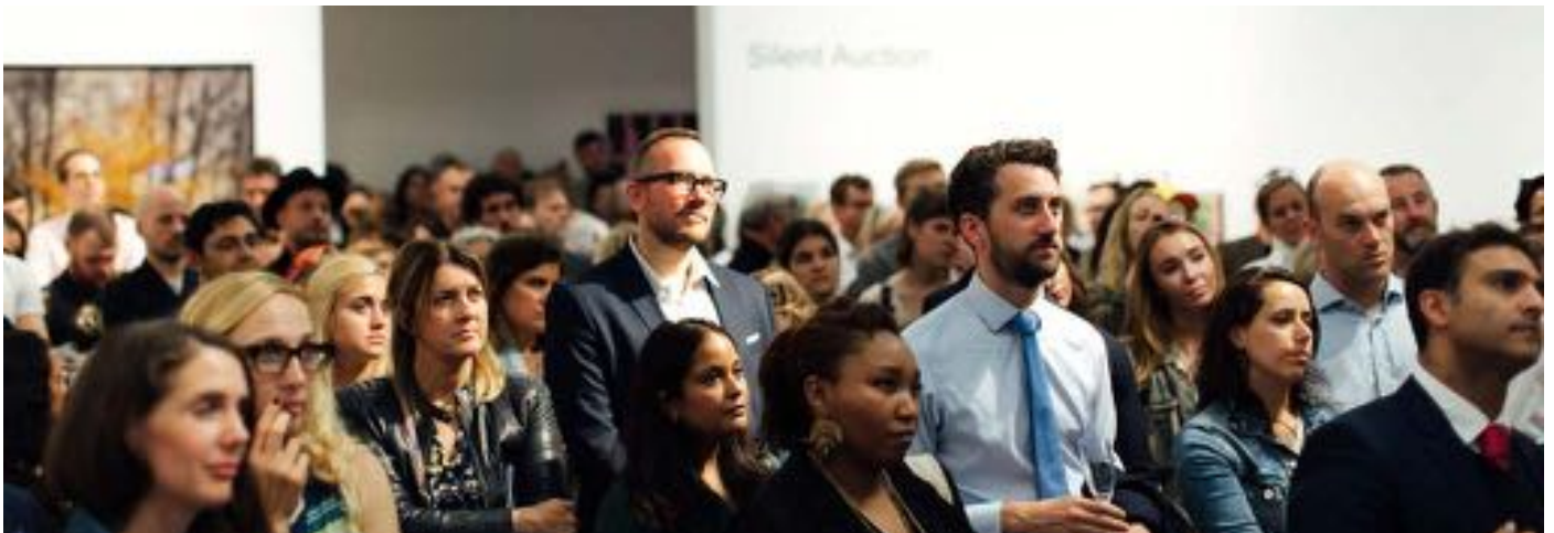
Hospital Rooms Hauser & Wirth Auction 2019

Hauser & Wirth have been a key supporter of Hospital Rooms over the past three years through annual auctions that have collectively raised over £200,000 for the charity. In 2021, the auction supported Hospital Rooms' most pioneering project to date with South West London and St George's Mental Health Trust as part of their newly built Trinity and Shaftesbury buildings at Springfield University Hospital. This has resulted in 20 major artworks and a programme of 120 art workshops for people using mental health services. This partnership marks a new commitment to make collective and significant change through a series of events, exhibitions and fundraising initiatives taking place until 2025.