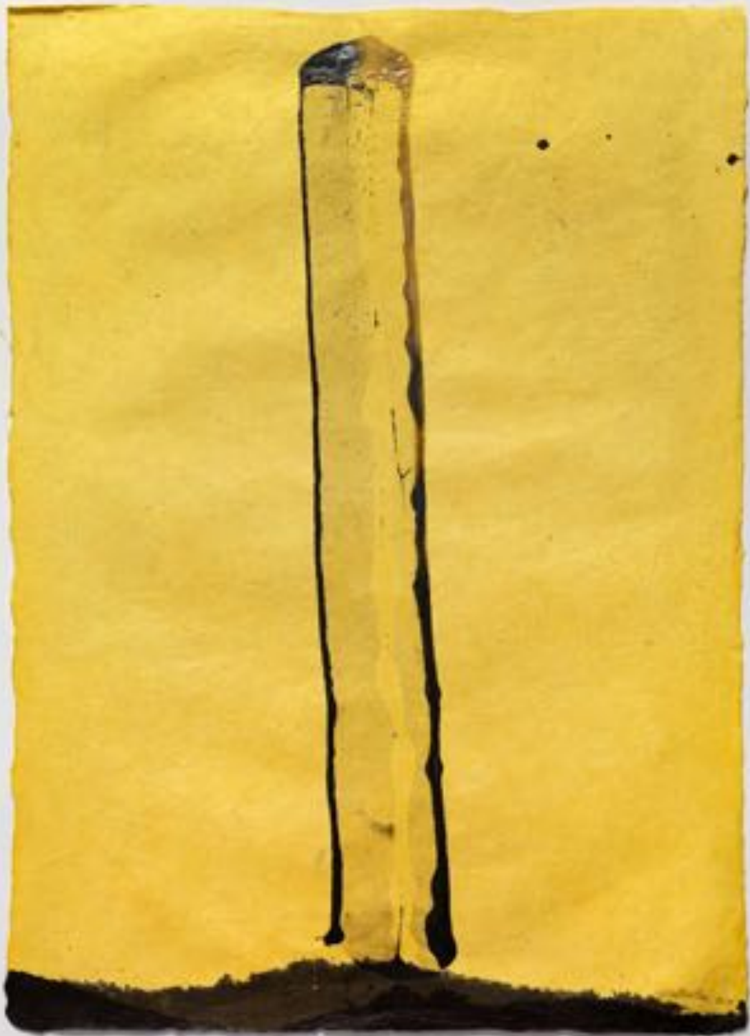
Takesada Matsutani Untitled, 2018

Vinyl adhesive, ink on yellow paper 76.3 x 51 cm / 30 x 20 1/8 inches