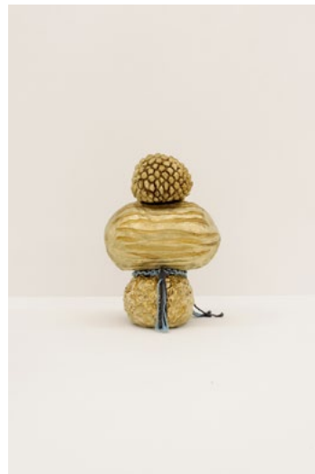
ERIKA VERZUTTI Venus Melancia (Watermelon Venus) , 2022

Papier-mâché, polystyrene, bronze, oil paint 39 3/8 x 59 1/8 x 3 1/8 inches (100 x 150 x 8 cm.) (EV22-028)