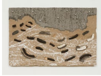
ERIKA VERZUTTI Too many boats , 2022

Papier-mâché, polystyrene, bronze, oil paint 39 3/8 x 59 1/8 x 3 1/8 inches (100 x 150 x 8 cm.) (EV22-025)