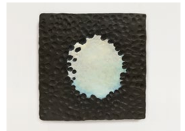
ERIKA VERZUTTI Tapioca Magritte , 2022

Papier-mâché, polystyrene, bronze, oil paint 39 3/8 x 59 1/8 x 3 1/8 inches (100 x 150 x 8 cm.) (EV22-024)