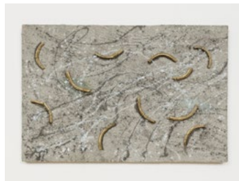
ERIKA VERZUTTI Churros with Wind , 2022

Oil paint on bronze 16 1/2 x 13 3/4 x 1 3/5 inches (42 x 35 x 4 cm.) Edition of 3 plus 2 artist's proofs (#1/3) (EV22-012.1)