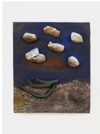
ERIKA VERZUTTI Praia Noturna com Jangadas (Nocturne beach with rafts) , 2022

Bronze, acrylic paint, cotton thread 30 3/4 x 15 3/8 inches (78 x 39 cm.) Edition of 3 plus 2 artist's proofs (#1/3) (EV22-016.1)