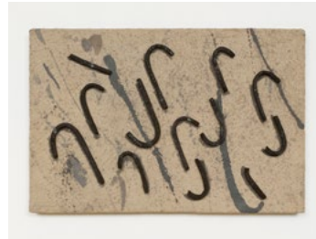
ERIKA VERZUTTI Umbrellas and Chaos , 2022

Papier-maché, polystyrene, bronze, found stone sculpture, clay, wax 13 x 20 1/2 x 4 3/4 inches (33 x 52 x 12 cm.) (EV22-027)