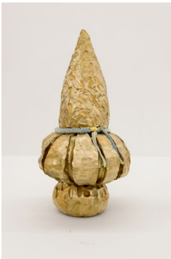
ERIKA VERZUTTI Venus Gokula , 2022

Papier-mâché, polystyrene, acrylic paint 18 1/2 x 10 5/8 inches (47 x 27 cm.) (EV22-034)