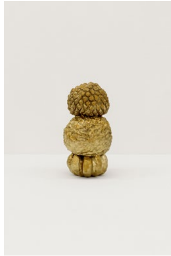
ERIKA VERZUTTI Venus Doll , 2022

Bronze, acrylic paint, cotton thread 43 1/4 x 23 5/8 inches (110 x 60 cm.) Edition of 3 plus 2 artist's proofs (#1/3) (EV22-032.1)