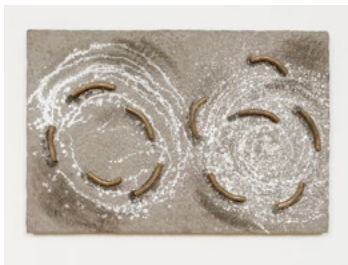
ERIKA VERZUTTI Churros Turbulence , 2022

Oil paint on bronze 16 7/8 x 16 7/8 x 2 3/8 inches (43 x 43 x 6 cm.) Edition of 3 plus 2 artist's proofs (#1/3) (EV22-011.1)