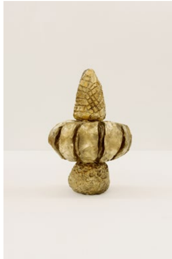
ERIKA VERZUTTI Venus with Drawing , 2022

Bronze, acrylic paint 15 3/4 x 7 7/8 inches (40 x 20 cm.) Edition of 3 plus 2 artist's proofs (#1/3) (EV22-018.1)