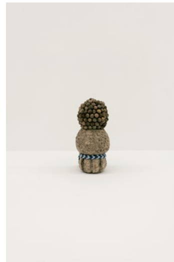
ERIKA VERZUTTI Venus Doll , 2022

Bronze, acrylic paint, cotton thread 19 1/4 x 20 7/8 x 13 3/4 inches (49 x 53 x 35 cm.) Edition of 3 plus 2 artist's proofs (#1/3) (EV22-033.1)