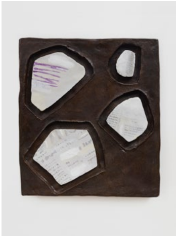
ERIKA VERZUTTI White Out , 2022

Oil paint on bronze 13 3/4 x 15 3/4 x 2 3/8 inches (35 x 40 x 6 cm.) Unique in a series of 3 (EV22-010)