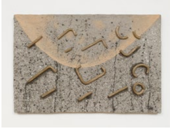
ERIKA VERZUTTI Magnolia , 2022

Papier-mâché, polystyrene, bronze, oil paint 39 3/8 x 59 1/8 x 3 1/8 inches (100 x 150 x 8 cm.) (EV22-025)