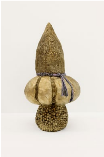
ERIKA VERZUTTI Venus Abelha (Bee Venus) , 2022

Bronze, acrylic paint, cotton thread 43 1/4 x 23 5/8 inches (110 x 60 cm.) Edition of 3 plus 2 artist's proofs (#1/3) (EV22-032.1)