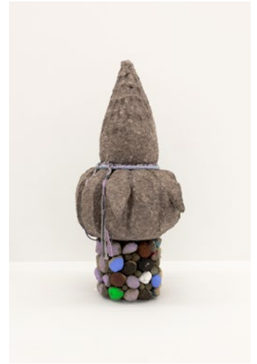
ERIKA VERZUTTI Venus with Mom , 2022

Bronze, acrylic paint 23 5/8 x 15 inches (60 x 38 cm.) Edition of 3 plus 2 artist's proofs (#1/3) (EV22-017.1)