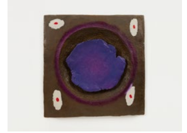
ERIKA VERZUTTI Tantra Roxo (Purple Tantra) , 2022

Papier-mâché, polystyrene, ceramics, oil paint 39 3/8 x 59 1/8 x 3 1/8 inches (100 x 150 x 8 cm.) (EV22-030)