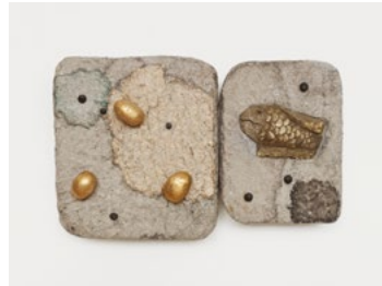
ERIKA VERZUTTI New Ideas , 2022

Papier-maché, polystyrene, bronze, found stone sculpture, clay, wax 13 x 20 1/2 x 4 3/4 inches (33 x 52 x 12 cm.) (EV22-027)