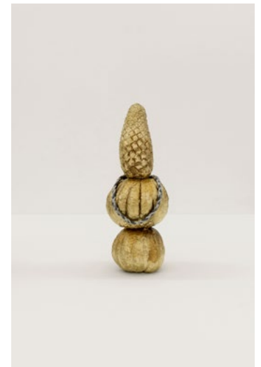
ERIKA VERZUTTI Venus Abacaxi (Pineapple Venus) , 2022

Papier-mâché, polystyrene, acrylic paint, cotton thread 15 3/4 x 7 1/8 inches (40 x 18 cm.) (EV22-031)