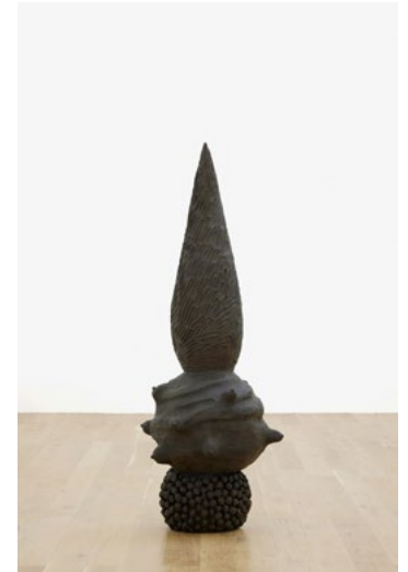
ERIKA VERZUTTI Venus of Cream , 2020

Papier-maché, polystyrene, ceramics, oil paint 39 3/8 x 59 1/8 x 3 1/8 inches (100 x 150 x 8 cm.) (EV22-029)