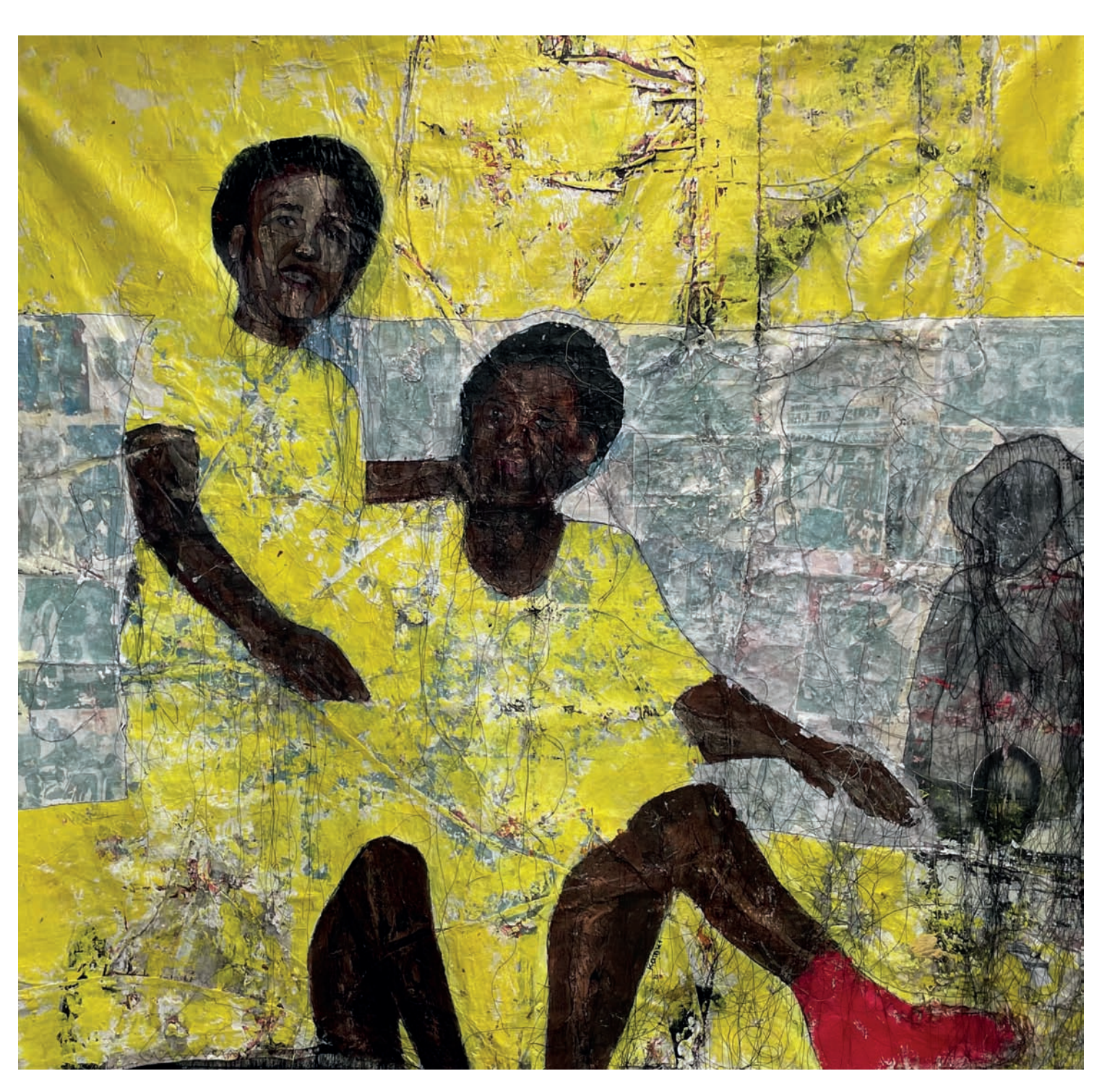
Kaloki Nyamai Vandu Vala Twekala 2, 2022 Mixed media, acrylic, collage stitching on canvas Framed 228,5 x 226,5 cm