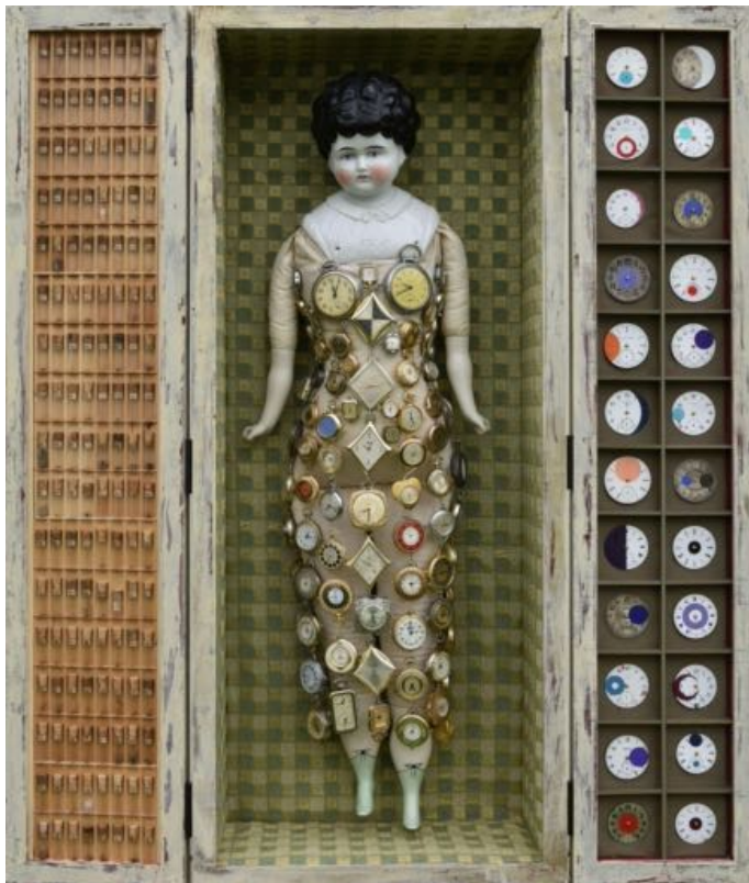
Carlos Estevez. Timekeeper , 2020. Assemblage, 32 3/4 x 28 1/4 x 5 1/2 in.