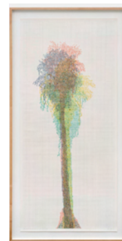
Numbers and Trees: Palm Canyon Series 7, Set 8 (quartet), Tree #4, Nomlaki, 2022

© Charles Gaines / Galerie Max Hetzler Berlin | Paris | London. Photo: Nicolas Brasseur