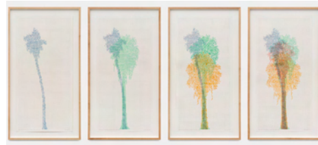
Numbers and Trees: Palm Canyon Series 6, Set 7 (quartet), 2022

Presented as 'quartets', many of the drawings contain the indigenous names referring to tribes living in California where the trees have been photographed. These tribe names as well as 'quartets' are part of a system ruling the titles, just as there is a system to produce the figures.