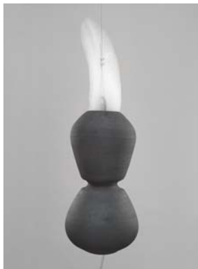
Roger Hiorns Untitled , 2008 Ceramic, compress, and foam 17 3/8 x 8 5/8 x 8 5/8 inches 44 x 22 x 22 cm HIORO0002