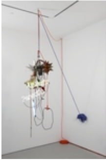
Jason Rhoades Chandelier 5 , 2006 3 neon phrases ("Agujerito," "Panecillo," "Chorito"), 2 transformers, orange three-plug extension cord, rope, armature wire, goat head, 2 star-shaped lamps, whip, and reins 76 3/4 x 31 1/2 x 23 5/8 inches 194.9 x 80 x 60 cm RHOJA0844