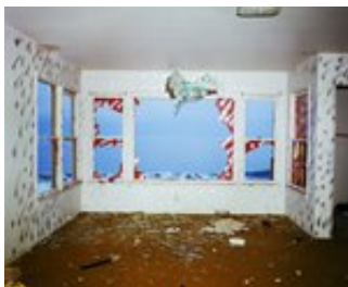
John Divola Zuma #12 , 1977 Archival pigment print on rag paper 24 x 30 inches 61 x 76.2 cm Edition 2 of 10 DIVJO0004