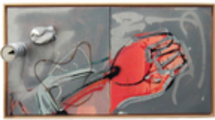
Martin Kippenberger Alkoholfolter , 1982 Mixed media and beer cans on two (2) canvases 19 11/16 x 39 3/8 inches 50 x 100 cm KIPMA0022