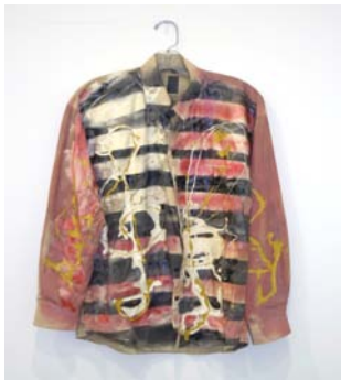
Isa Genzken Untitled (shirt) , n.d. (ca.1998) Acrylic paint, spray paint, and ink on shirt 36 x 25 inches 91.4 x 63.5 cm Signed and inscribed "For Bill" on shirt shoulder GENIS0069A