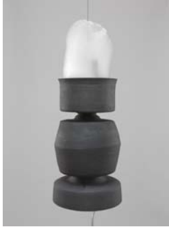
Roger Hiorns Untitled , 2008 Ceramic, compress, and foam 16 3/4 x 9 5/8 x 9 5/8 inches 42.5 x 24.5 x 24.5 cm HIORO0001