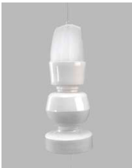
Roger Hiorns Untitled , 2008 Ceramic, compress, and foam 15 1/8 x 8 5/8 x 8 5/8 inches 38.3 x 22 x 22 cm HIORO0003