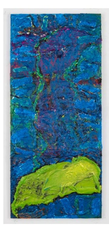
SYLVIA SNOWDEN Green V, 2021

Acrylic on canvas 72 x 48 inches (182.9 x 121.9 cm.) (SYS22-002)